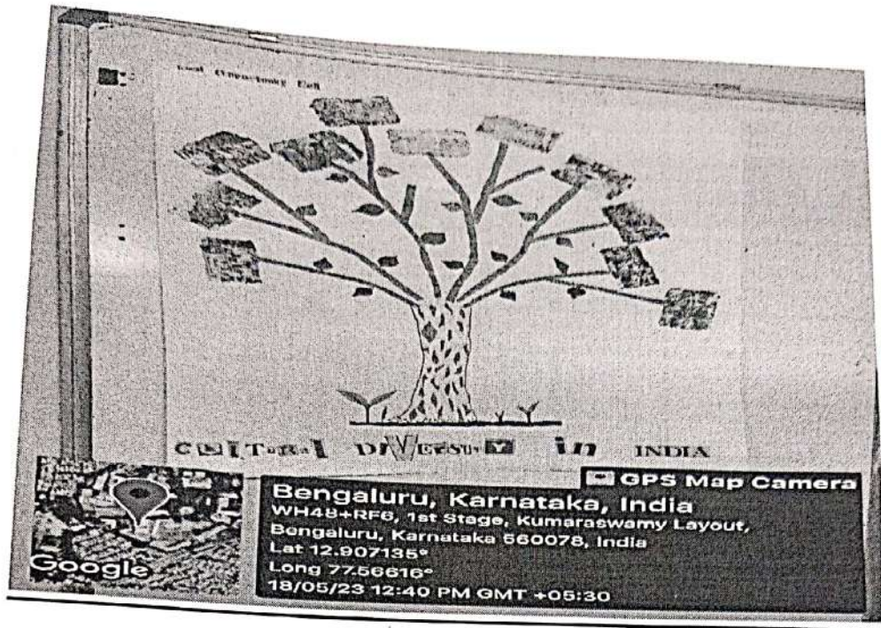
Sample of Collage done by MBA Students