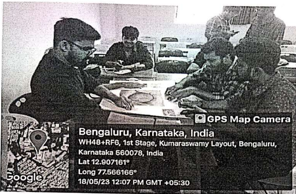
Student's participation in equal opportunity cell collage event