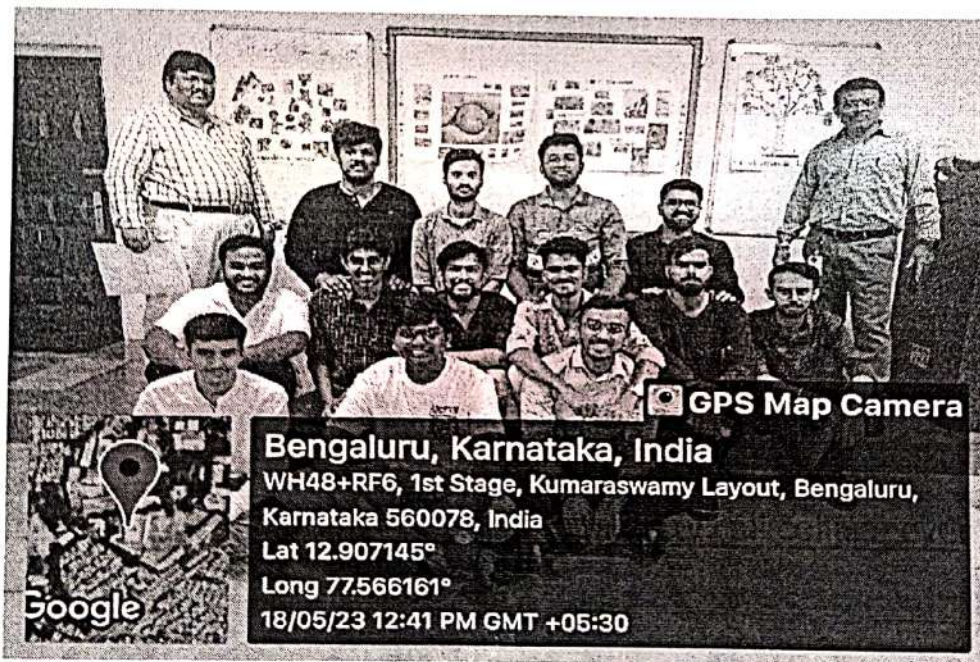
MBA Students with their collage display