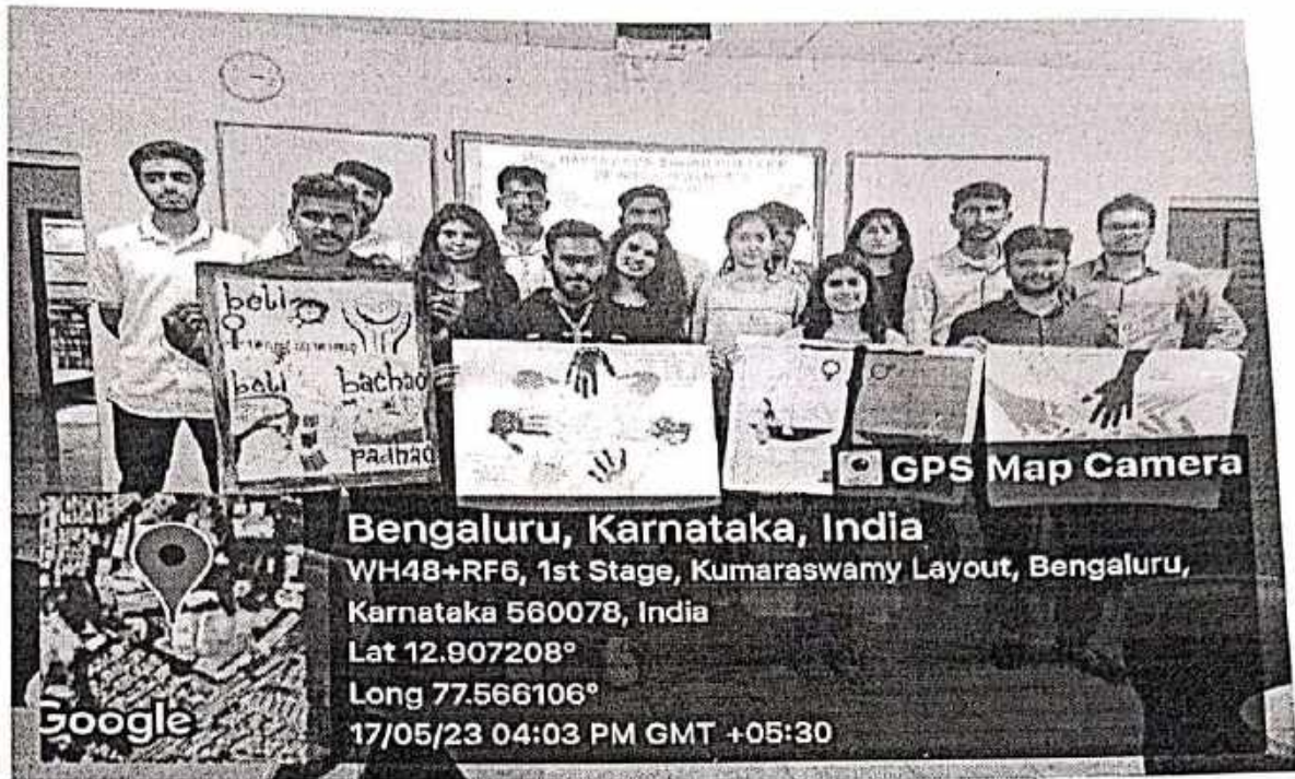
Students Showcasing their Painting to the Audience