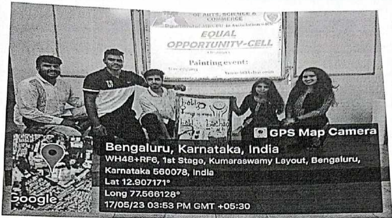
Individual Presentation of the teams on their painting theme