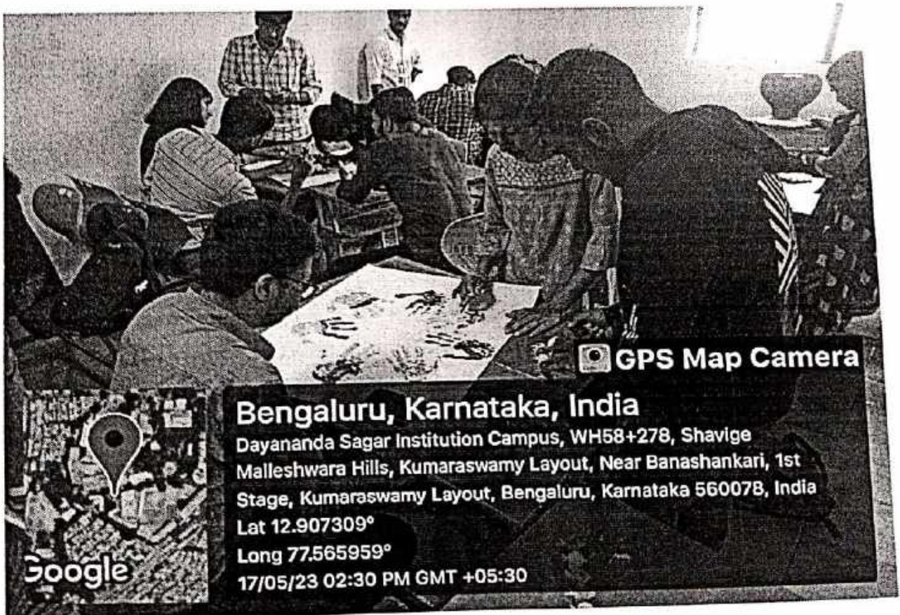
Student's involvement in Painting event