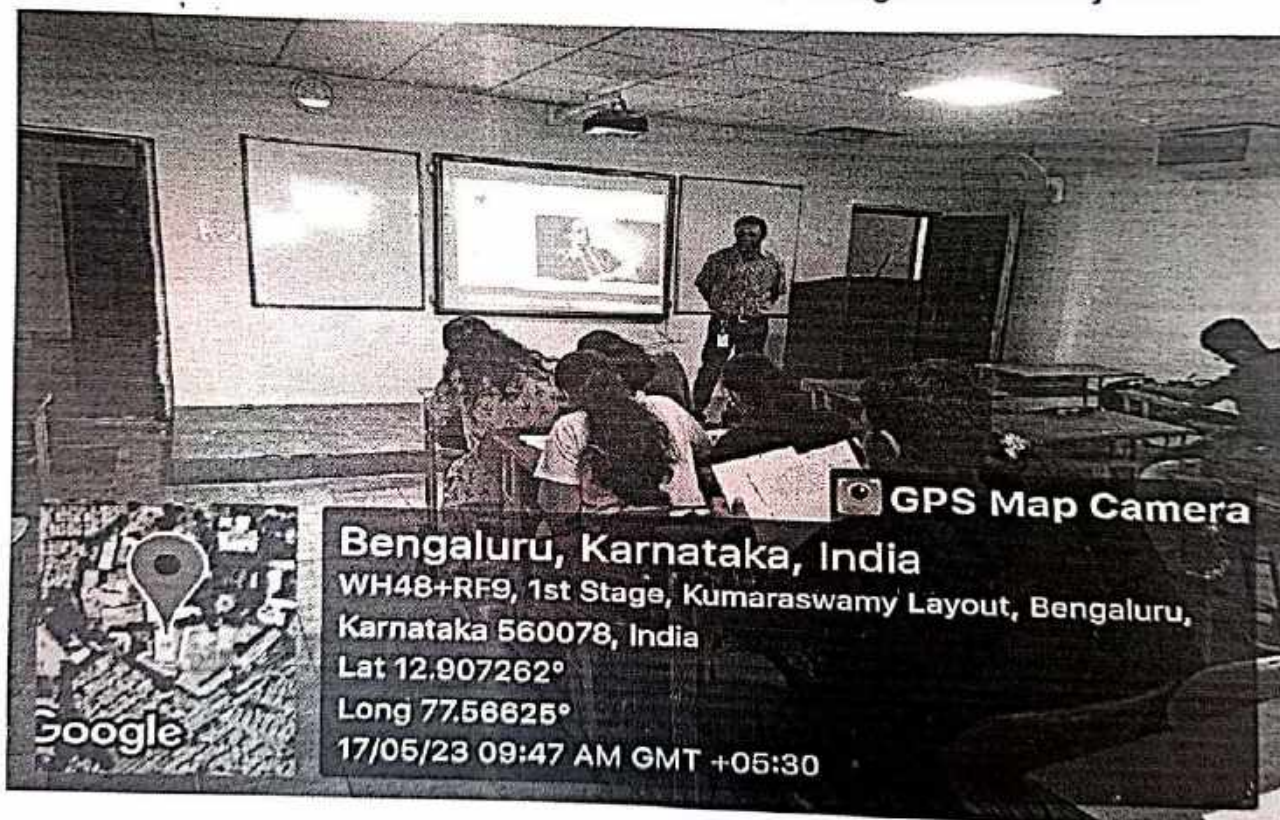
Pic 2: Faculty monitoring the Essay competition event