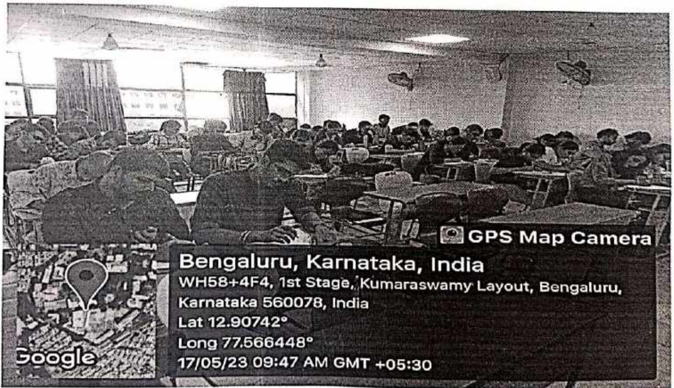
Pic 4: Students involment in Essay Writing Competition