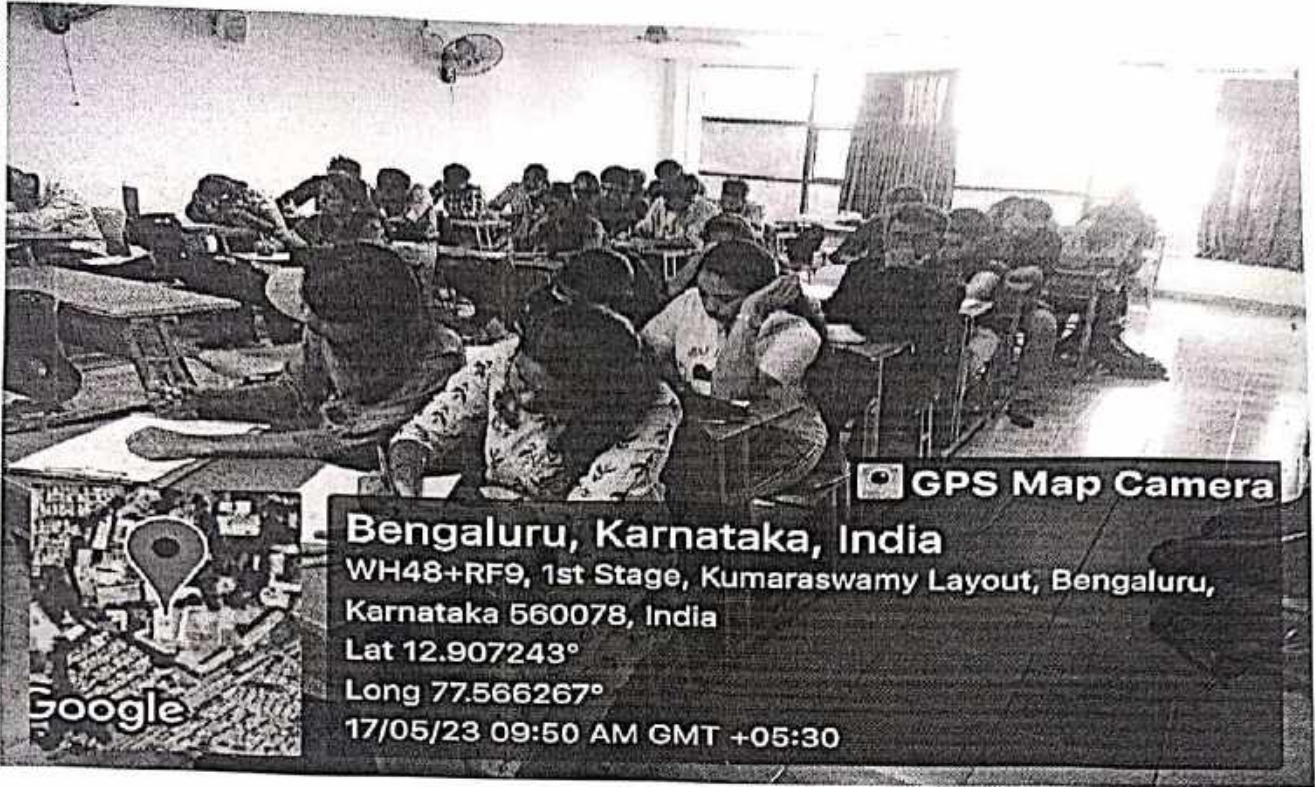
Pic 3: Students involment in Essay Writing Competition