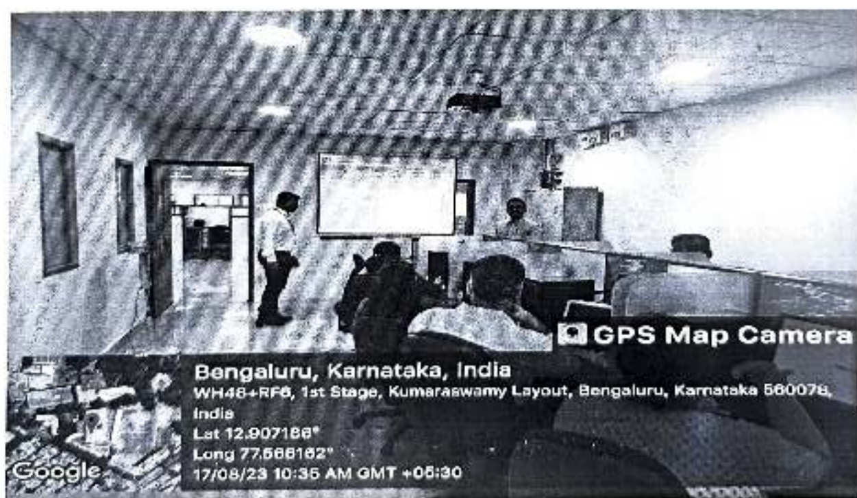
Figure 4: Participants in the Workshop