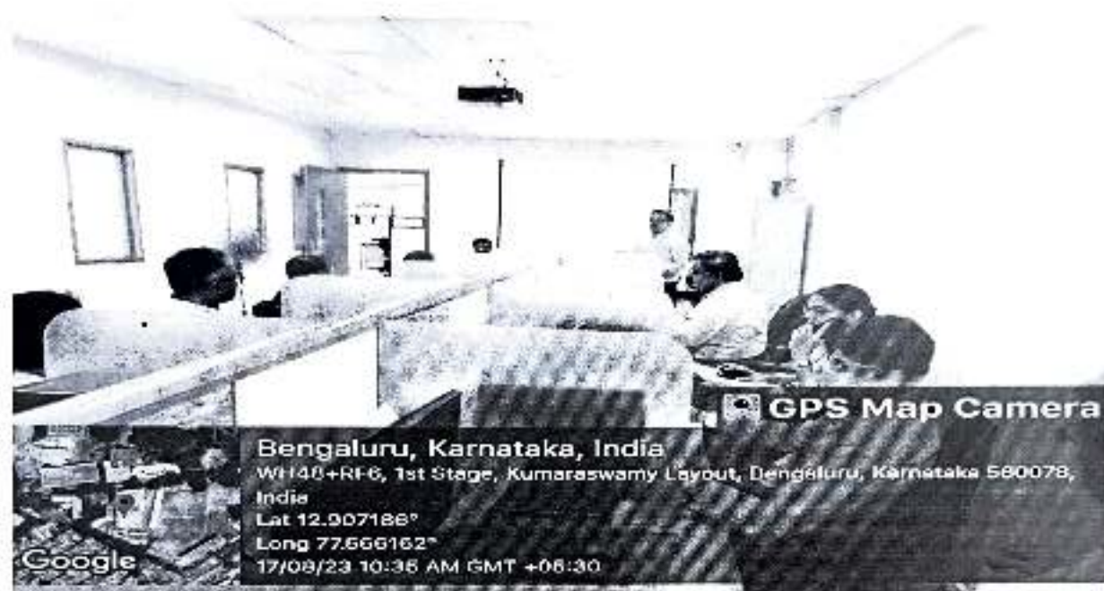
Figure 3: Faculty participants working on Google tools