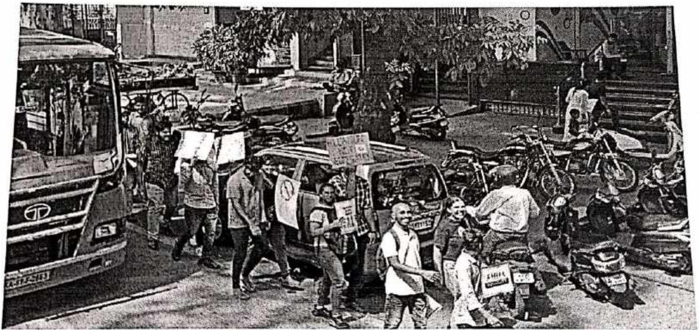
Students marching on the streets during the public rally on Equal Opportunity