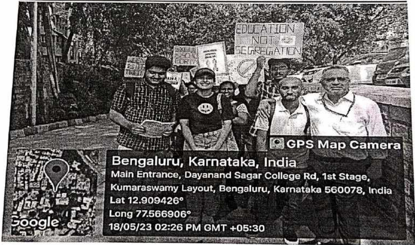
MBA students with slogans in front of Collage Gate