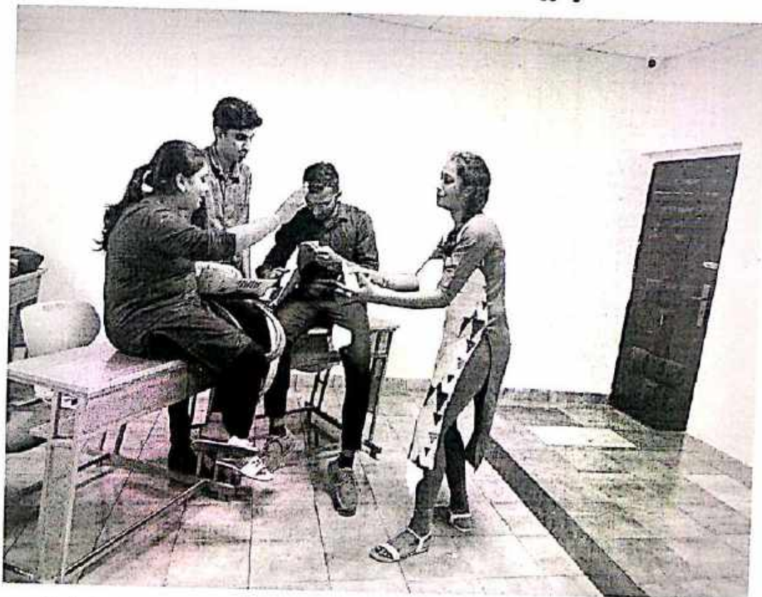
Pic 2: Students demonstrating the challenges of facing ragging in college through Skit