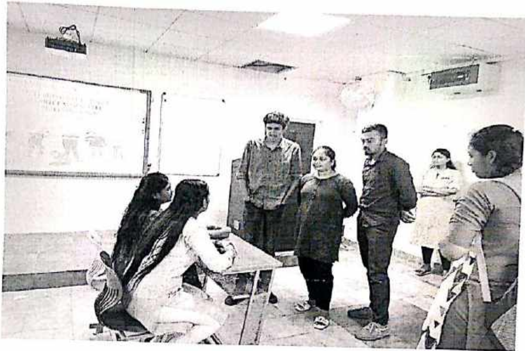
Pic 1: Students performing a Skit on Anti-ragging