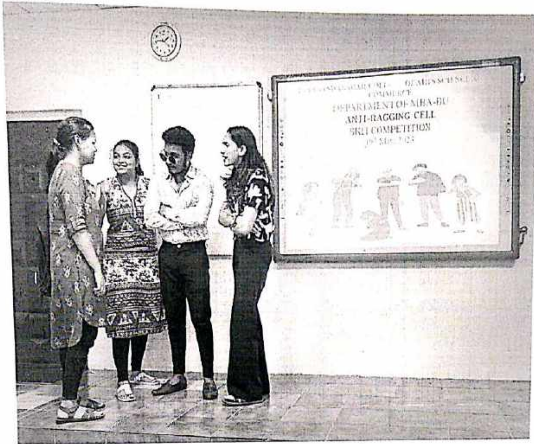
Pic 3: Students participating in the SKIT event as a part of Anti-ragging cell