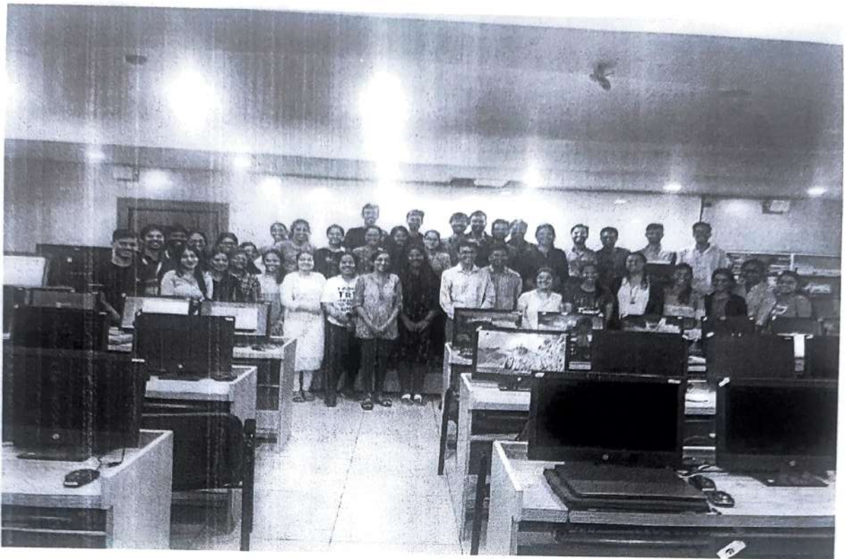
Figure 2: Group photo of resource person with participants