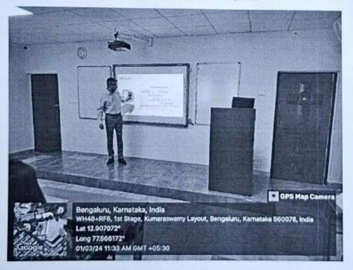
Figure 3: Presentation by the Guest speaker.