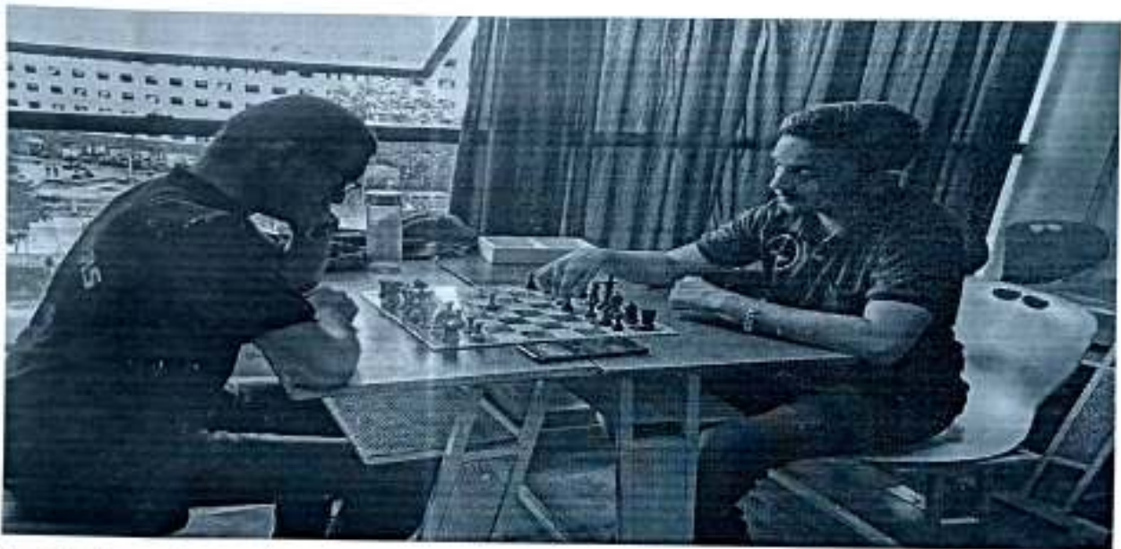
Pic-2 Students playing chess