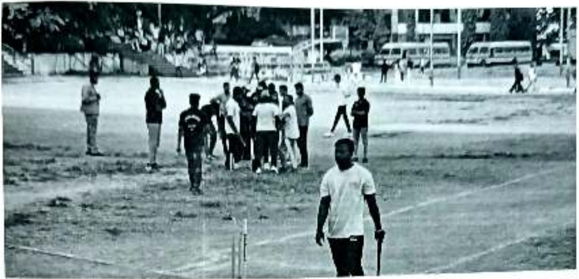
Pic-8 Students playing Cricket