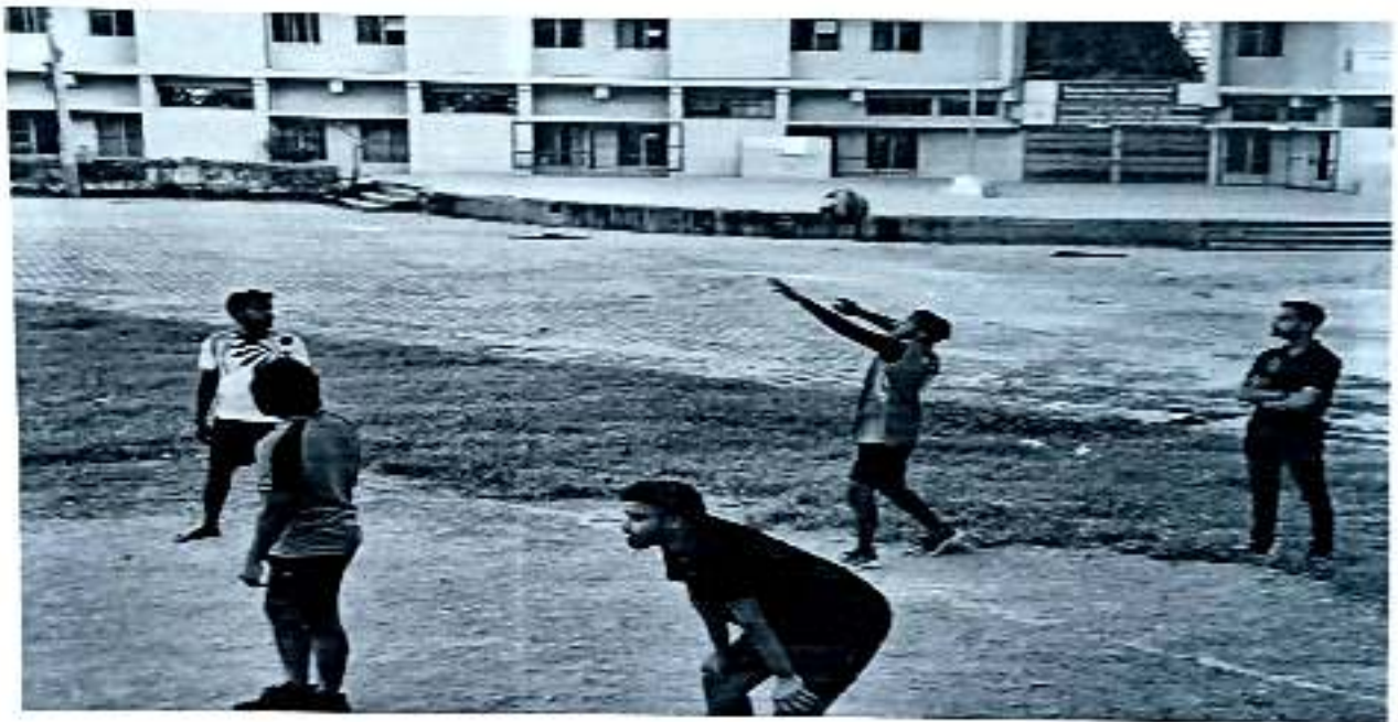
Pic-6 Students playing volleyball