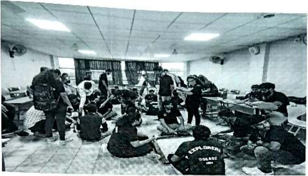
Pic-3 Students playing Carrom