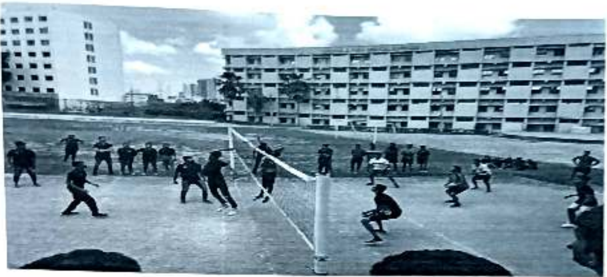
Pic-5 Students playing Volleyball