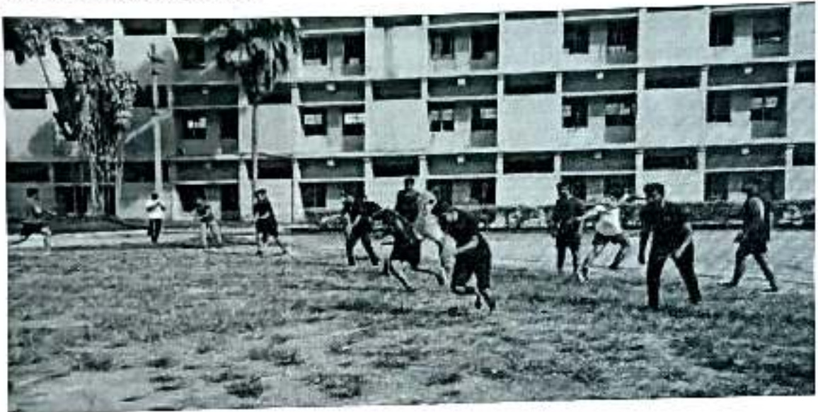
Pic-9 Students running race