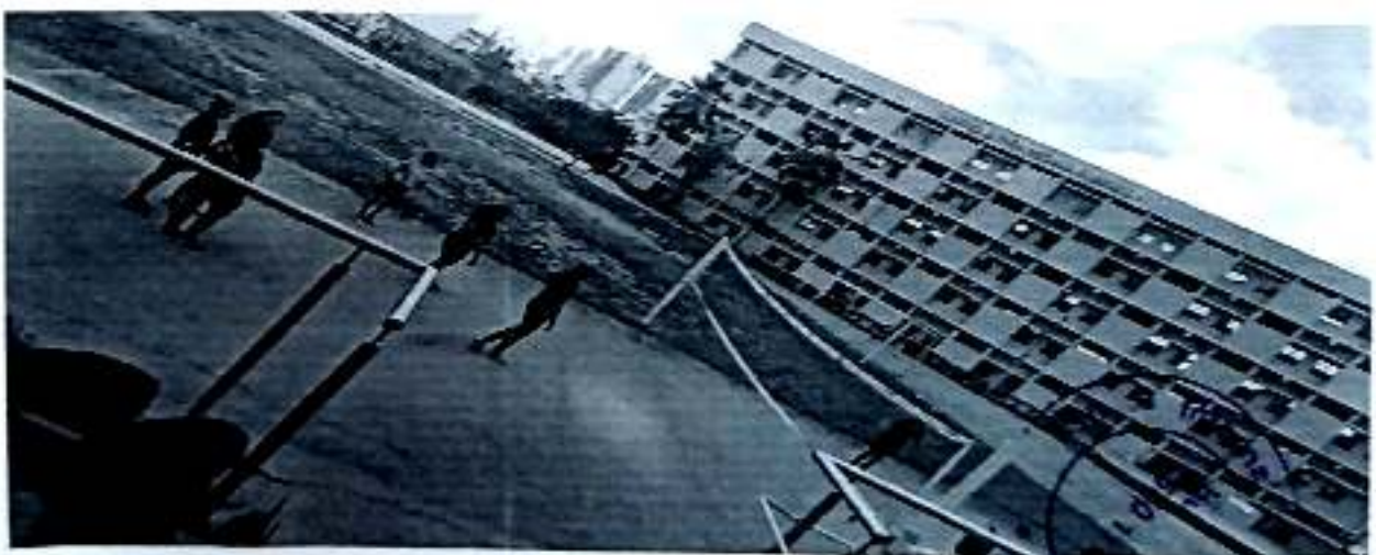
Pic-7 Students playing volleyball