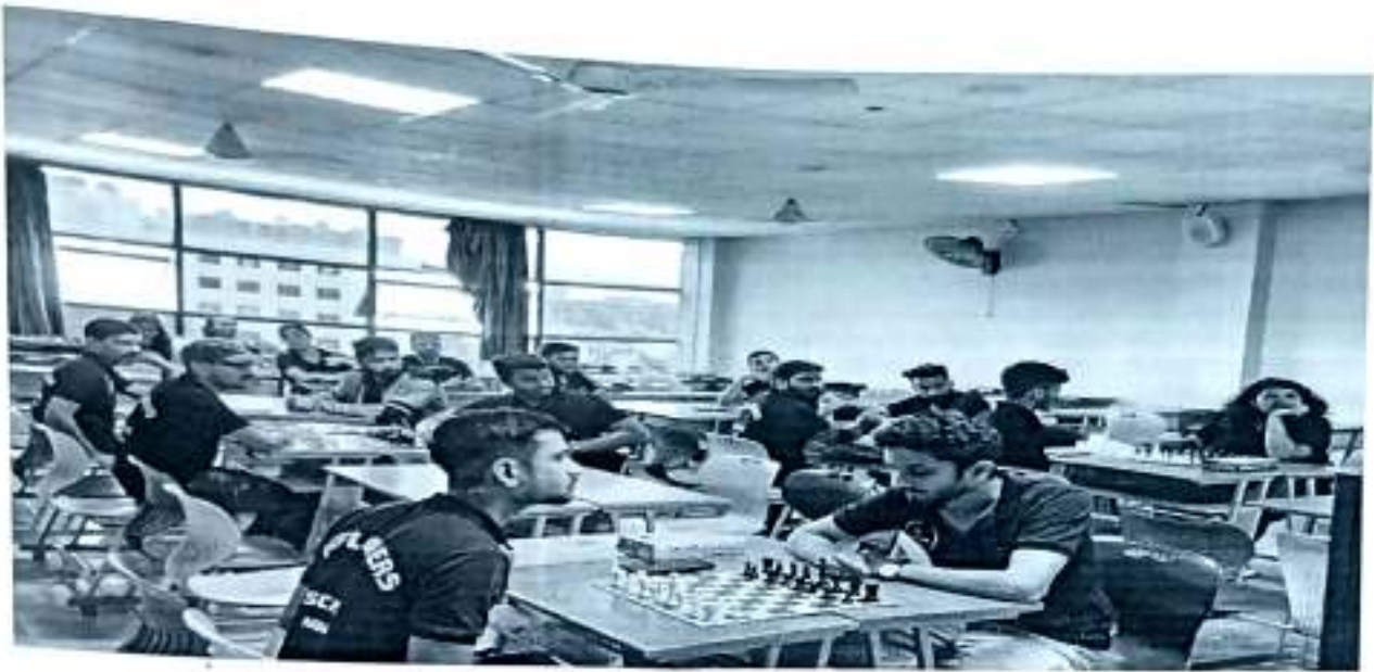
Pic-1 Students playing chess