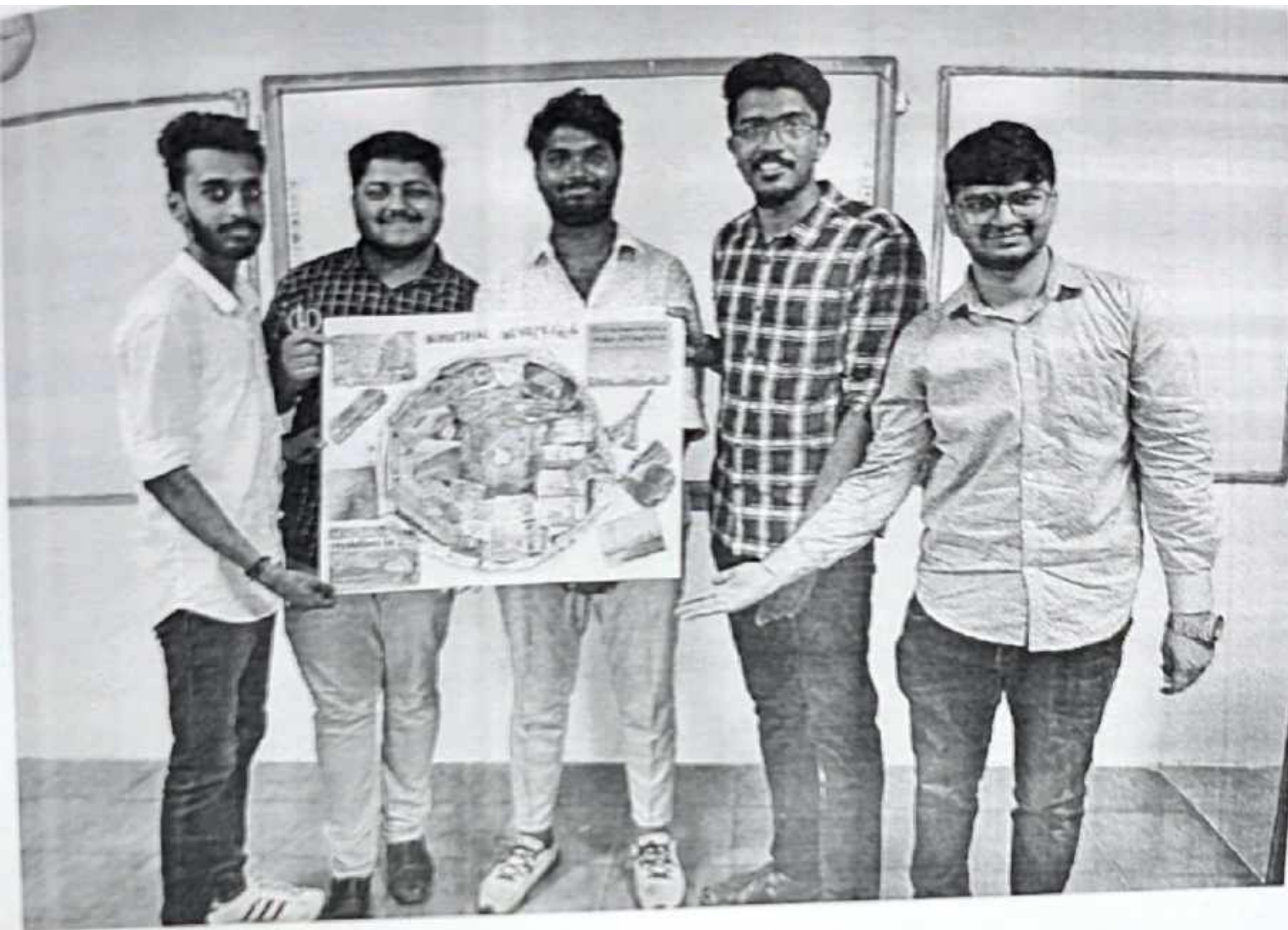
Theme save earth