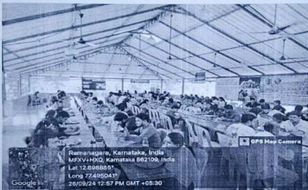
Figure 7: Students and Faculty having lunch at the Venue