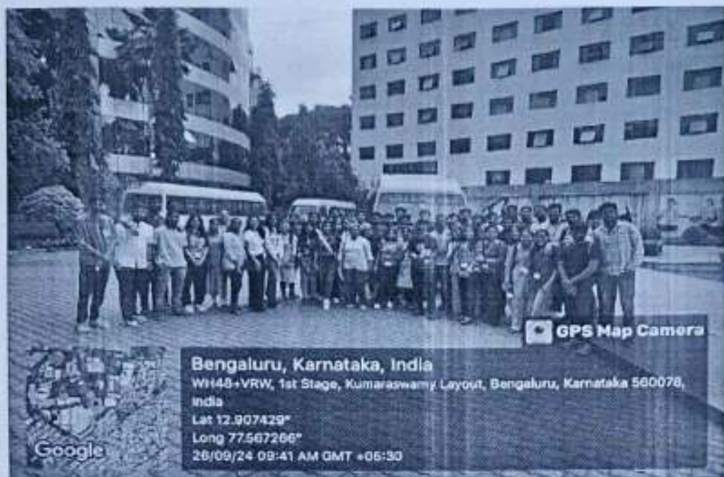
Figure 2: MBA Students (A Section) with the faculty coordinator at DSI before leaving for Pyramid Valley