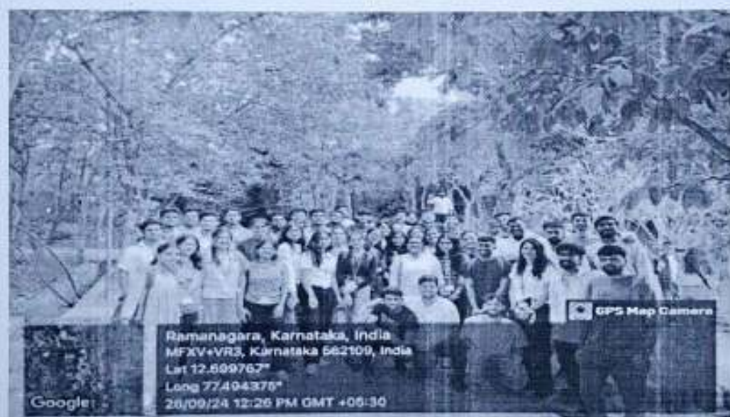
Figure 5: Group photo at Pyramid valley