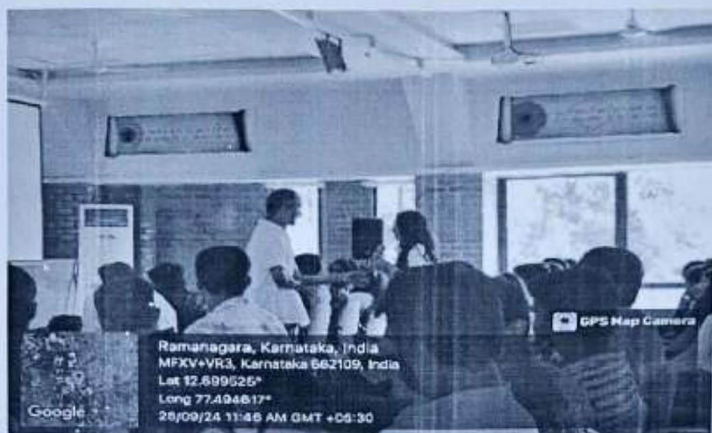
Figure 4: Student's interaction with the Resource person at Pyramid Valley