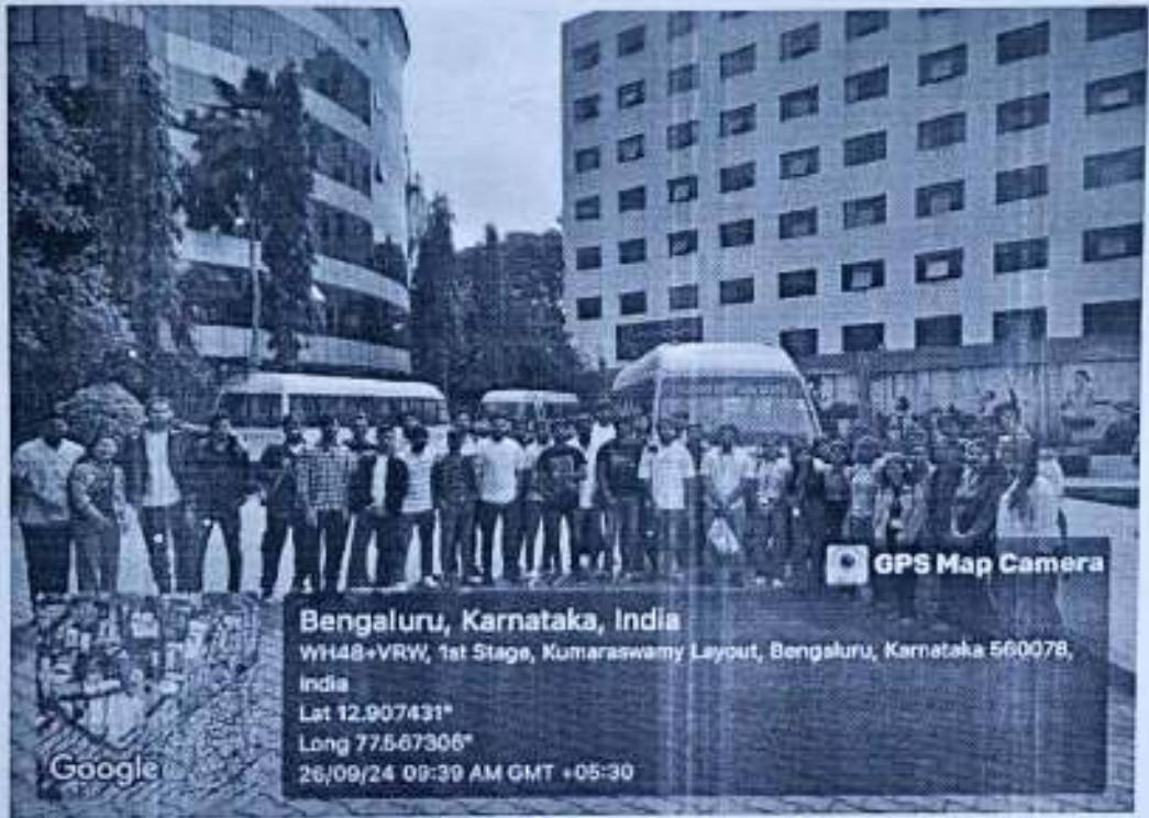
Figure 1: MBA Students (C Section) with the faculty coordinator at DSI before leaving for Pyramid Valley