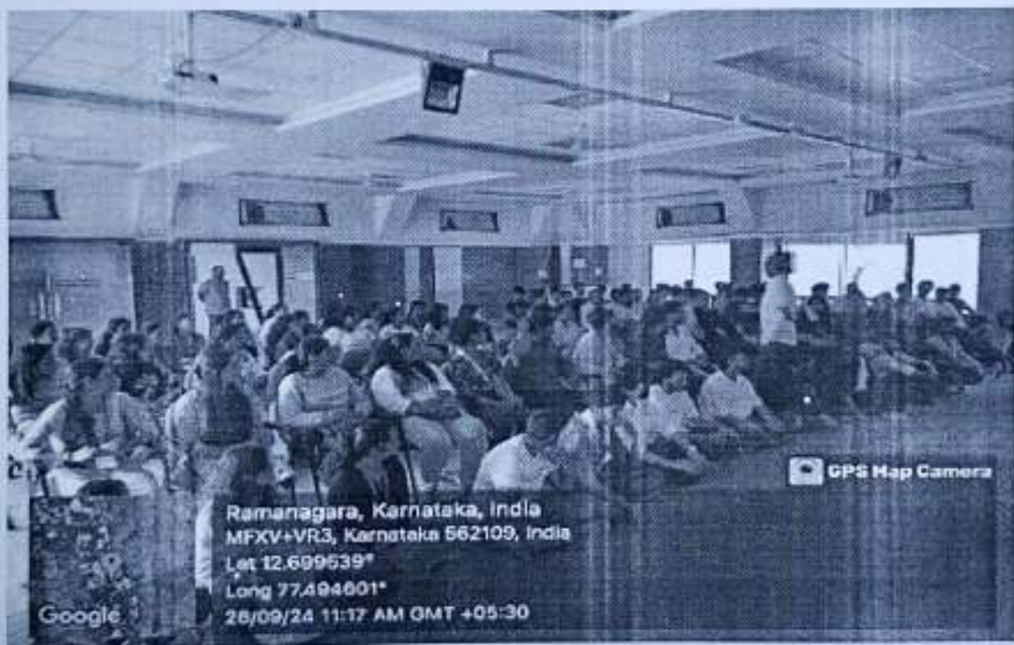
Figure 3: Volunteer at Pyramid Valley addressing the MBA students