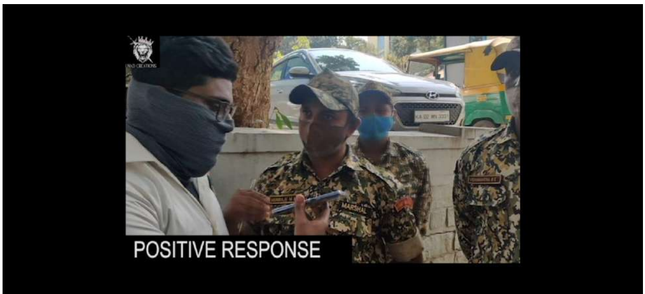
Photo 2: Students interviewing the military officers while conducting social experiments on rape survivors