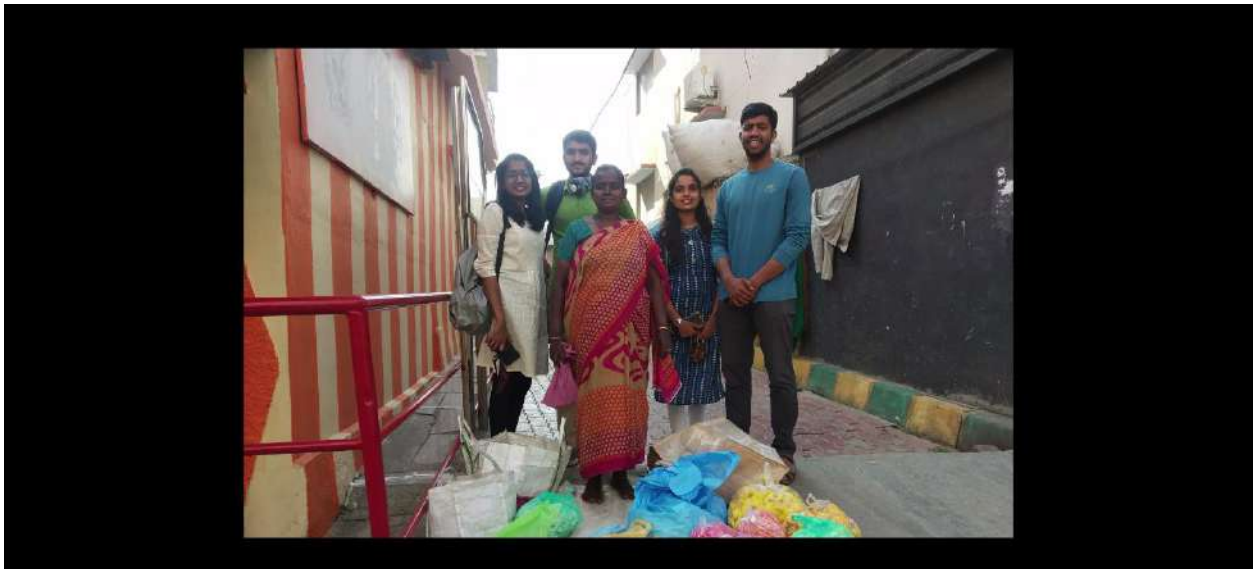
Photo 4: Students helping a street vendor by helping her restart her business post COVID-19 pandemic lockdown during a social experiment