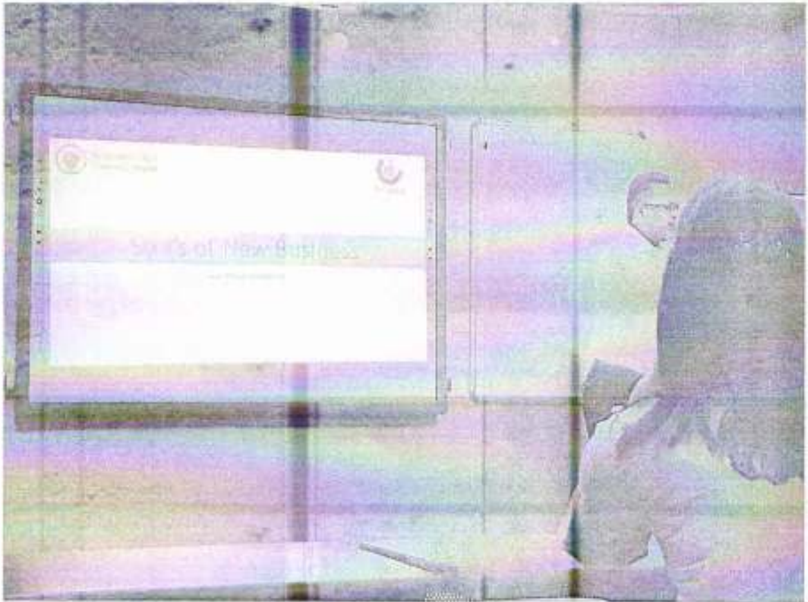
The main theme of the workshop : 6 I's of Business Life