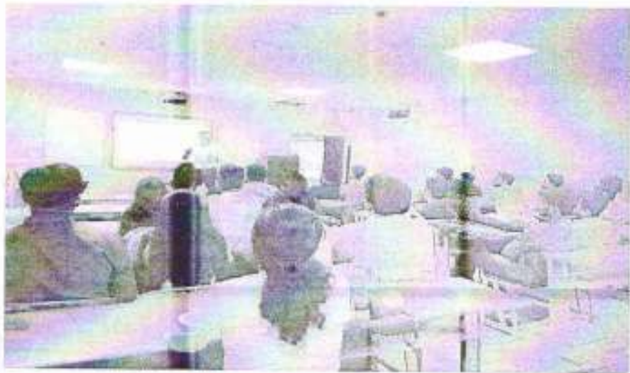
Resource Person presenting the Introduction to Entrepreneurship journey