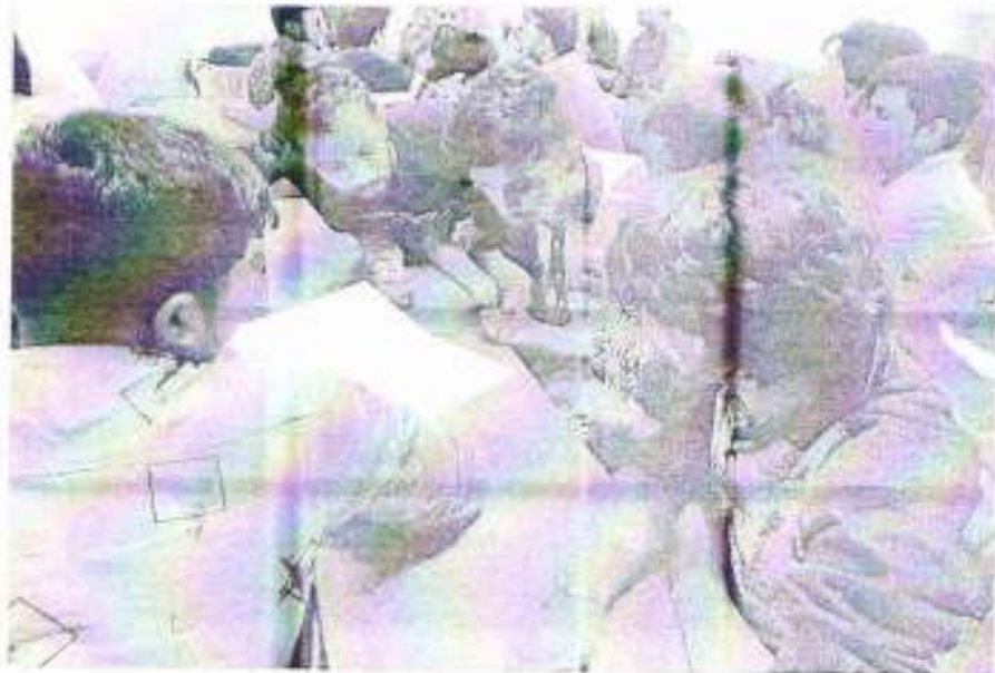
Another syndicate chalking out a plan of action