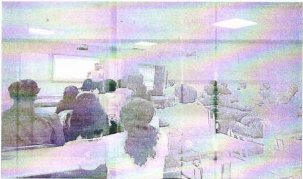
Resource Person introducing the Entrepreneurship Journey to the students