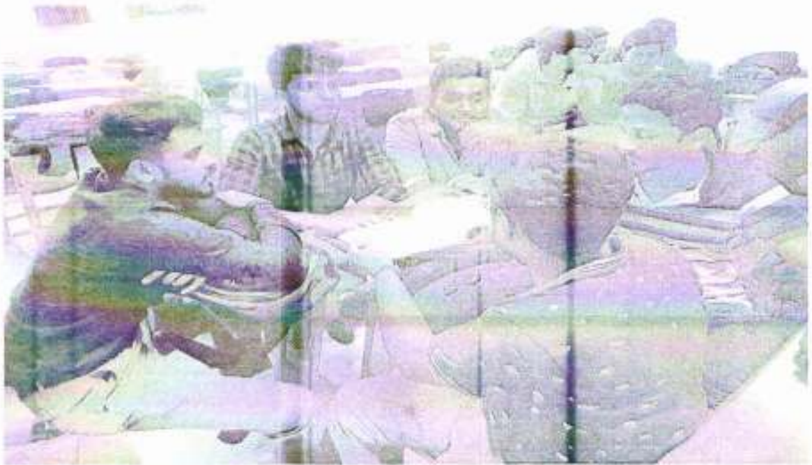
Brainstorming by the syndicates