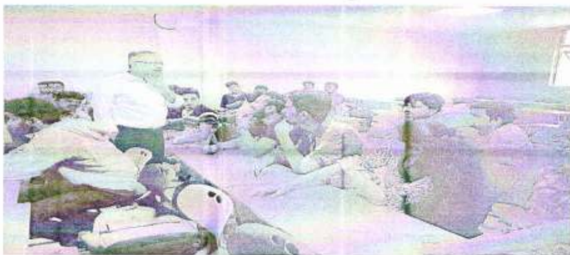
Resource Person providing personalized guidance to the group of students