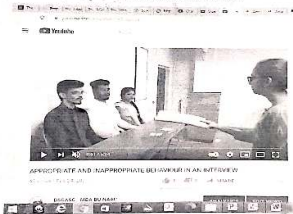
Photo 4: Roleplay on Appropriate and Inappropriate behaviours in an interview