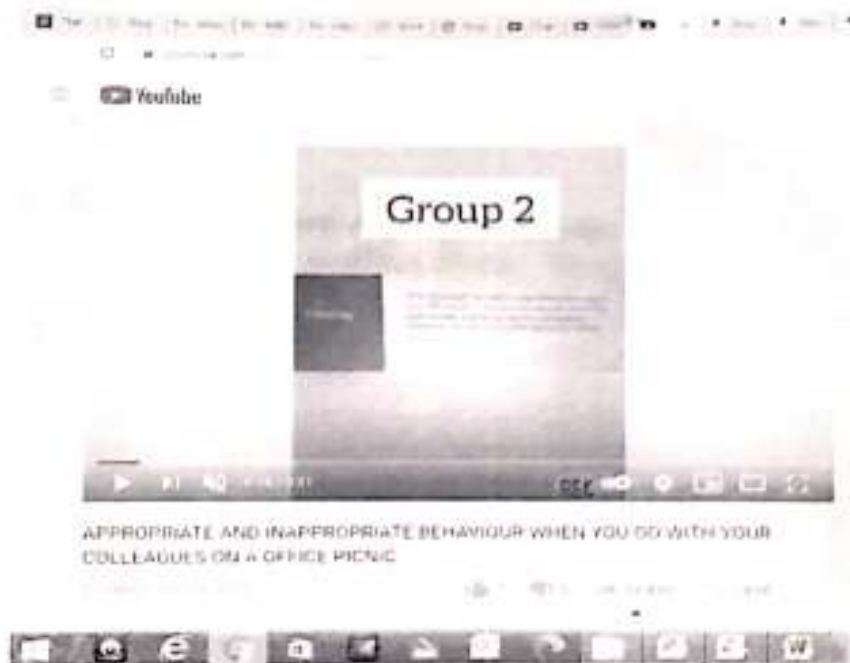
Photo 2: Roleplay on Appropriate and Inappropriate behaviours when one goes with your colleagues on an office picnic