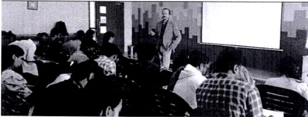
Pic1 : Trainer explaining the activity to students