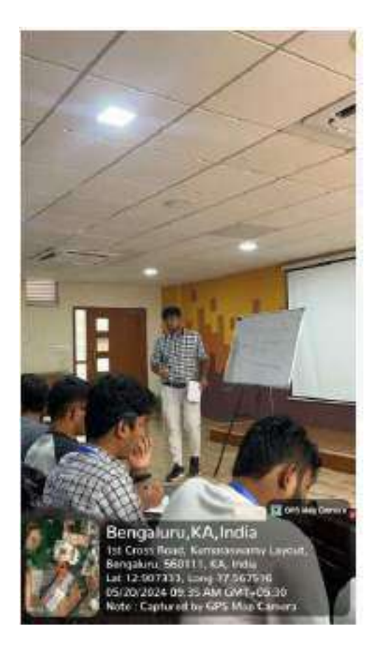
Pic 4 Trainer explaining the concepts