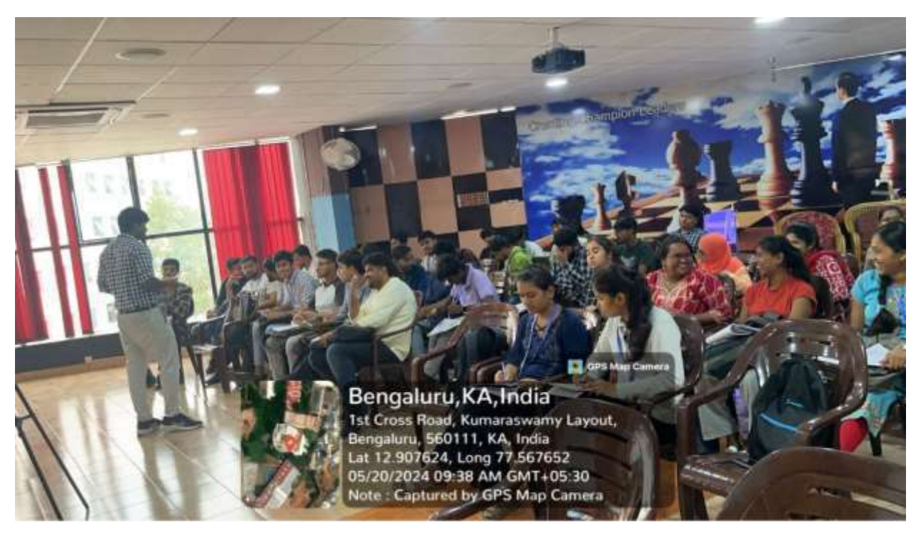
Pic 1: Speaker addressing the students of I MCA B section