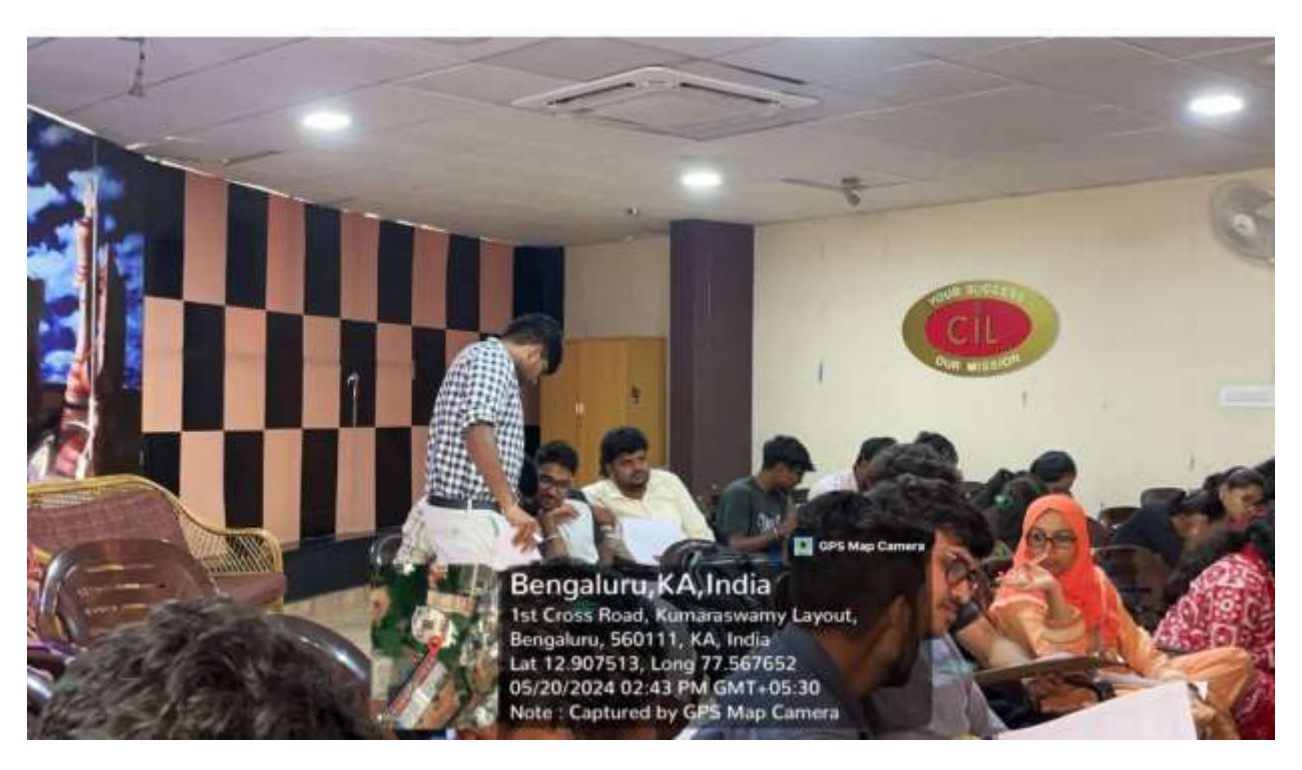
Pic 3 Checking with the students