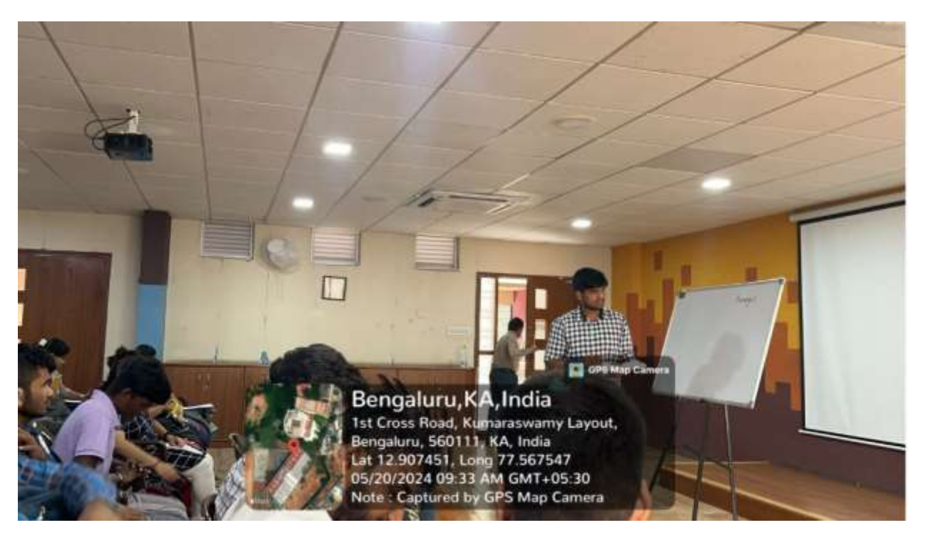
Pic 2 Explaining few tips and tricks