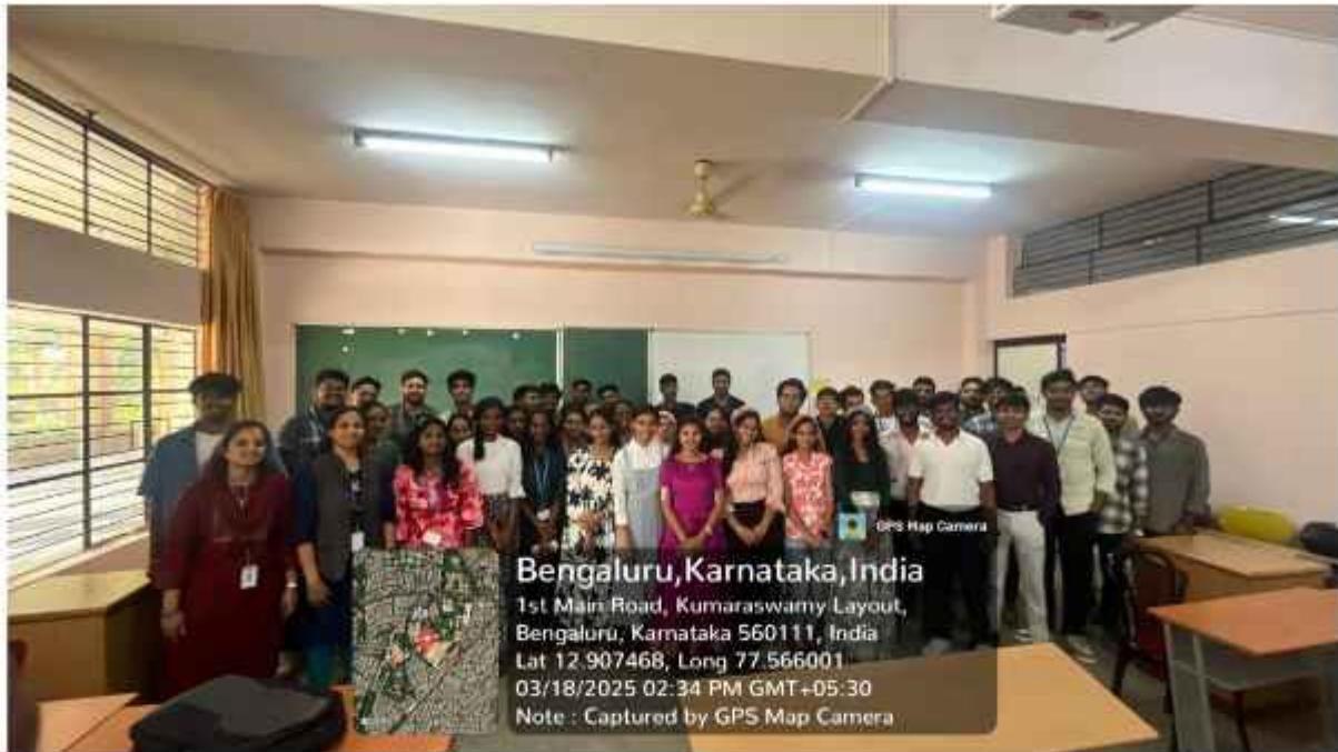
Photo 3- Retro Style