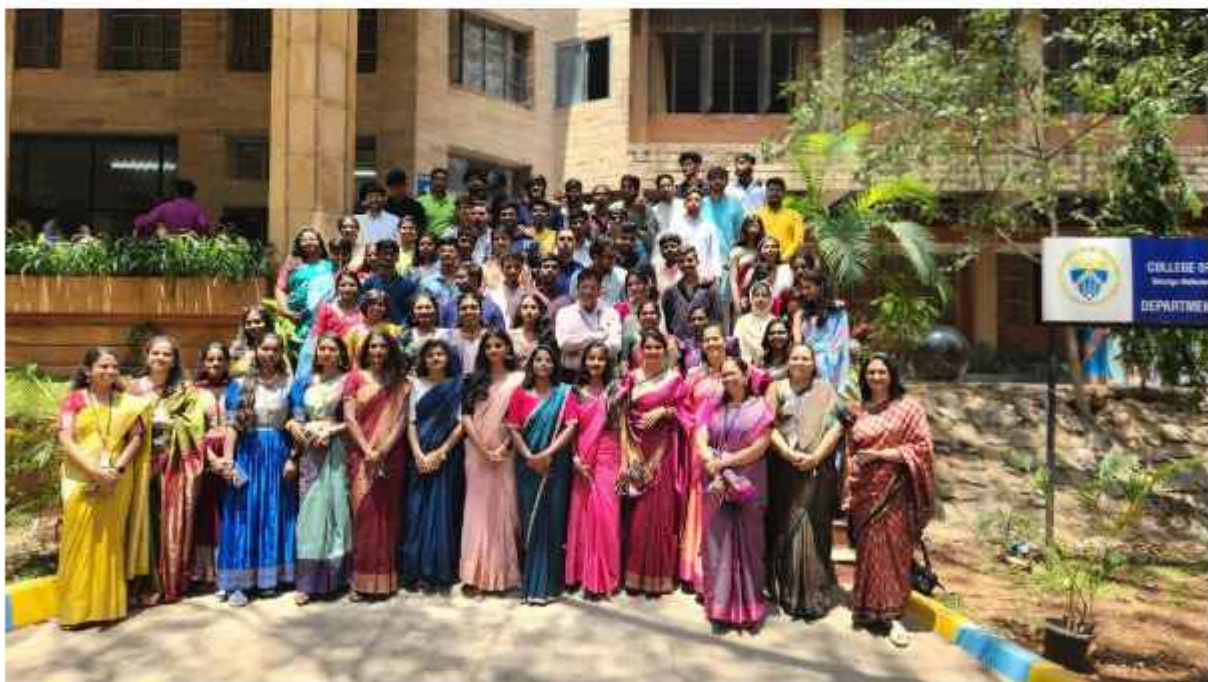
Photo 4- Ethnic Day