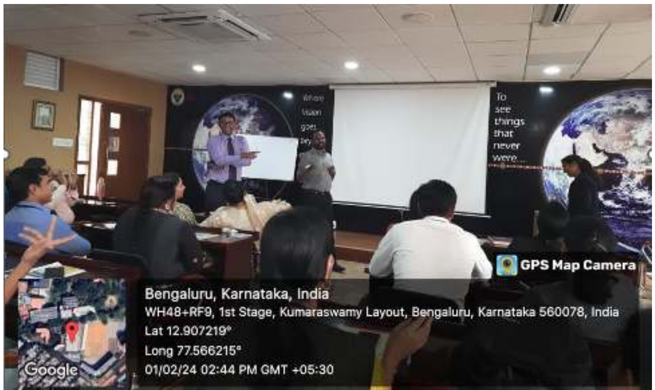
2. Speaker Explains the concept