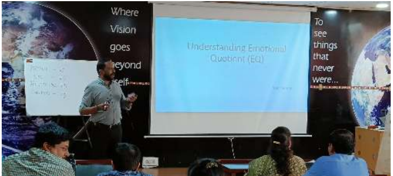
1. Speaker Explaining Emotional Quotient