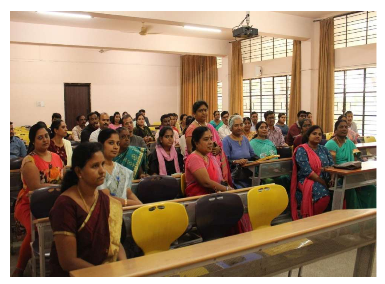
Fig-4,5:- Parents in the Session