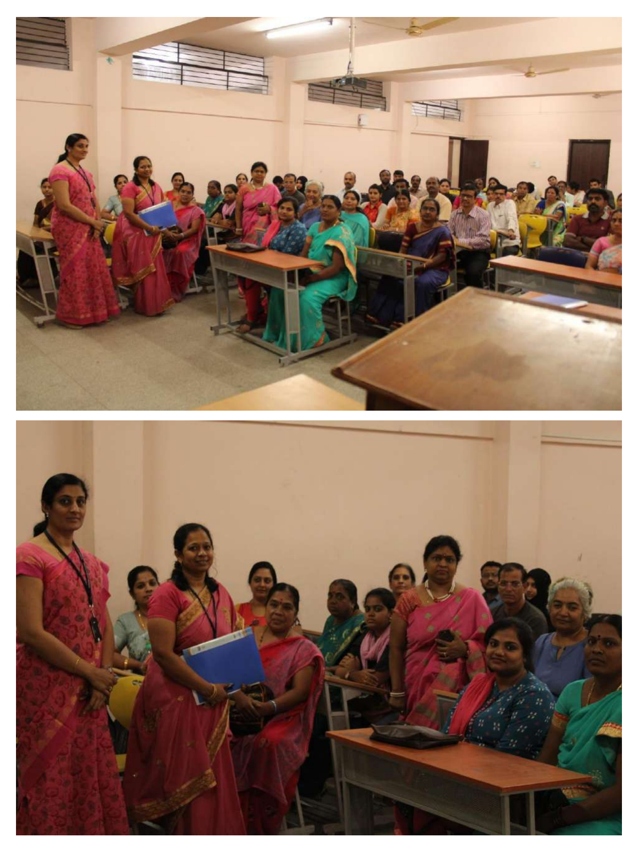
Fig-5,6:- Glimpses of Parent's- Teacher's Meet