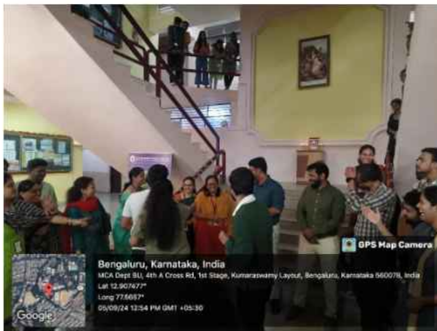
Pic(2)- Teachers in action, celebrating with joy