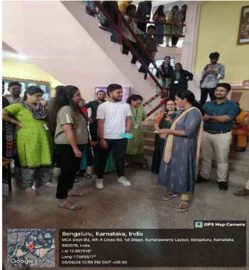
Pic(5)-Teacher actively engaged in an activity