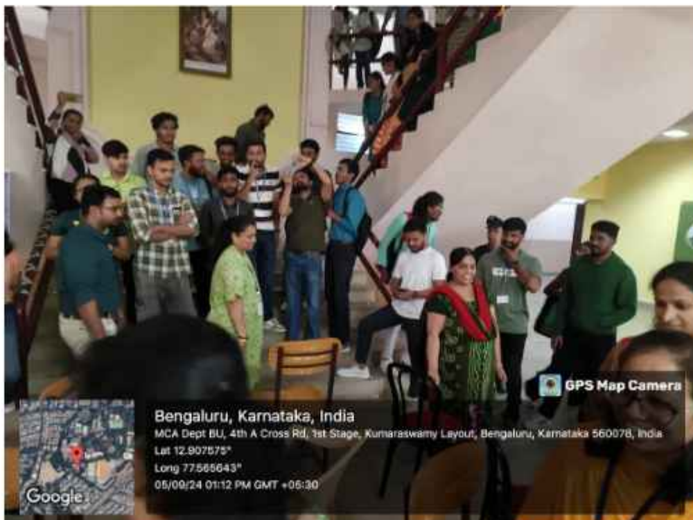
Pic(4)-Teachers participating in musical chair