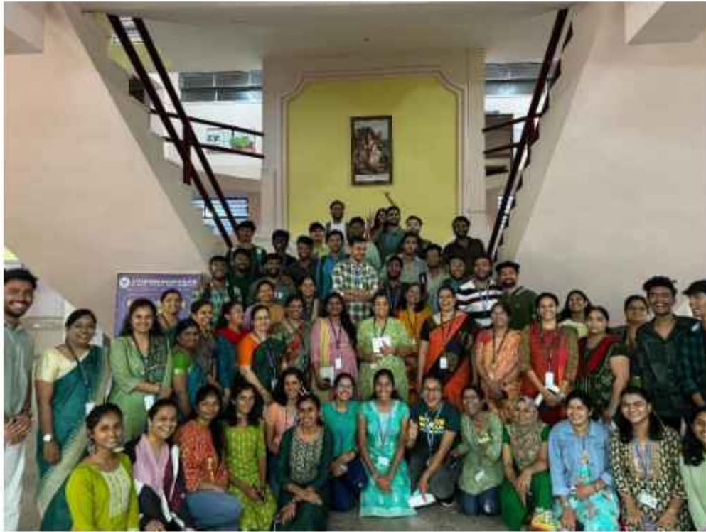
Pic(3)- Together in gratitude and celebration on Teachers' Day.