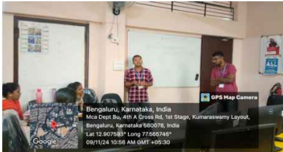
Pic(1)- Participant sharing his point of view