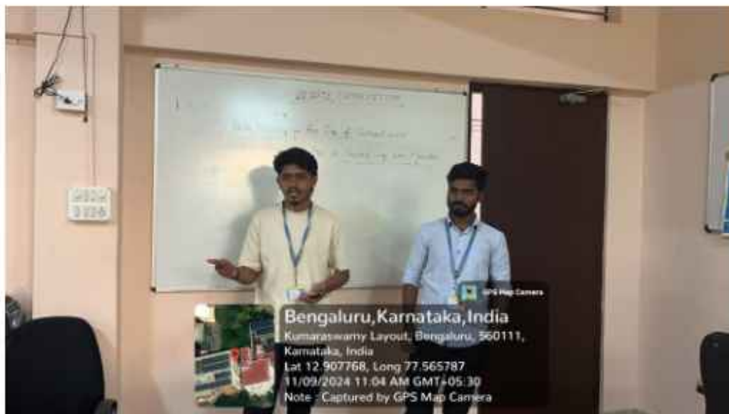
Pic(5)- Participants challenge each other's viewpoints in a spirit of collaboration.