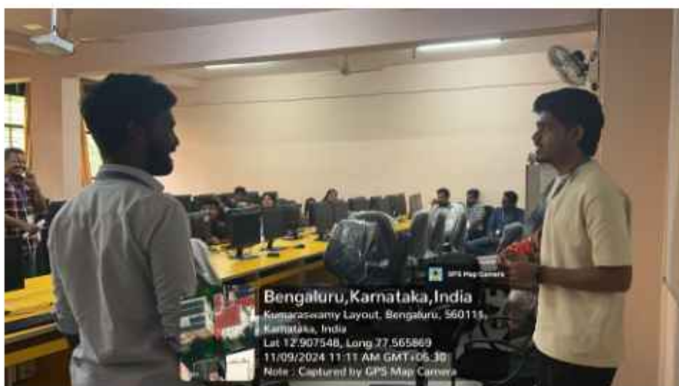
Pic(3)- Enriching their understanding through the sharing of diverse perspectives.