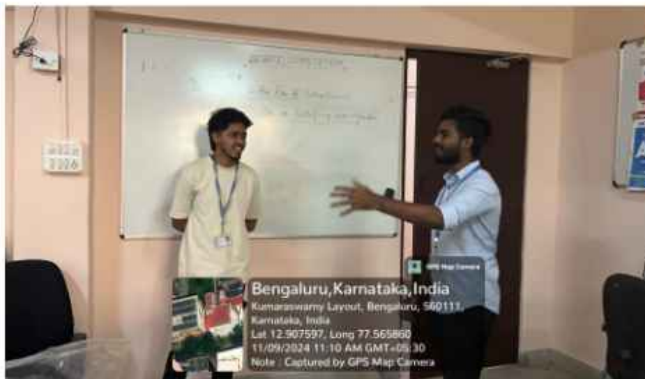
Pic(2)- Participants engage in a meaningful exchange of ideas