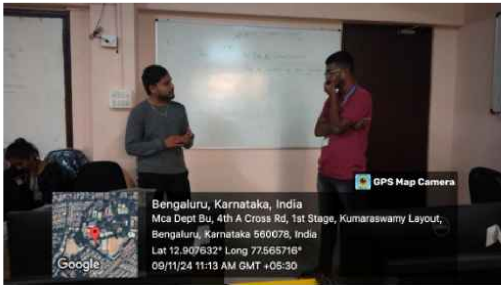
Pic(4)- In the spirit of inquiry, participants engage in a meaningful dialogue