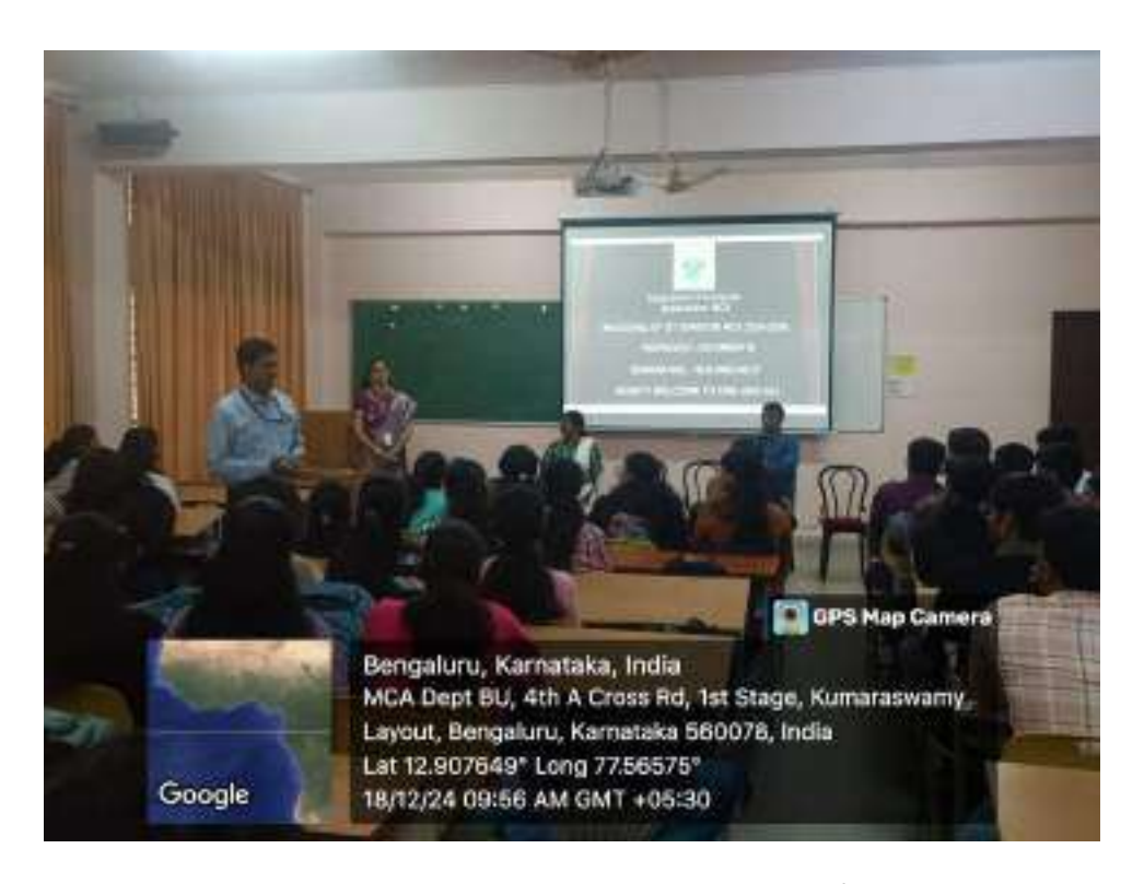
Pic(1)-Welcome speech by Principal on 18<sup>th</sup> Dec