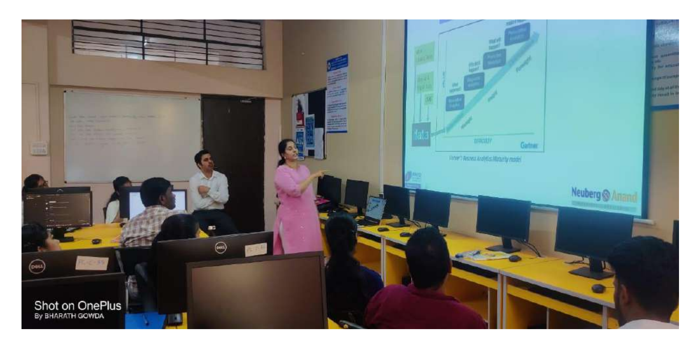
2. Introduction to PowerBI