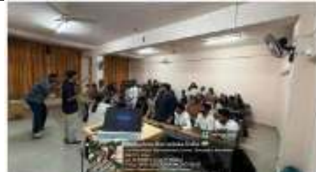
Pic(6) – Rapid fire