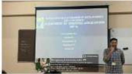
Pic(1) – Guess the programming language