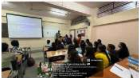
Pic(5) – Rapid fire