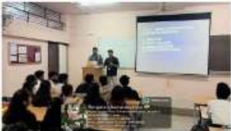
Pic(3) – Check the wrong option