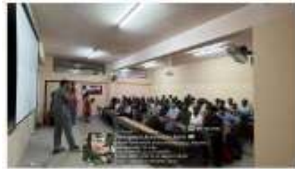
Pic(2)-Guess the programming language