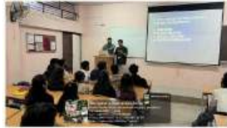
Pic(4) – Check the wrong option