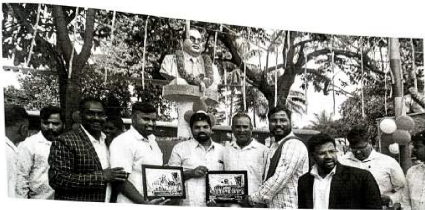
Guest felicitated at event