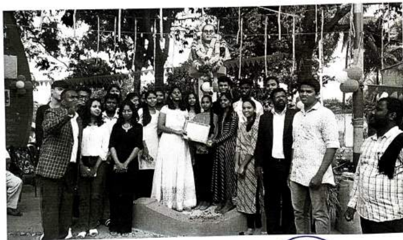
Students and staff at Ambedkar statue at Ambekar Aranyan Kendra