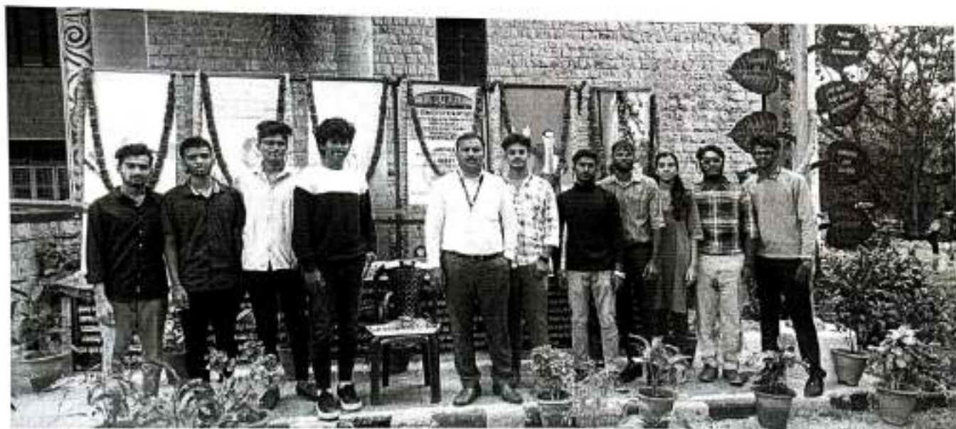
Students with Faculty Co-ordinator at Ambedkar Study Centre