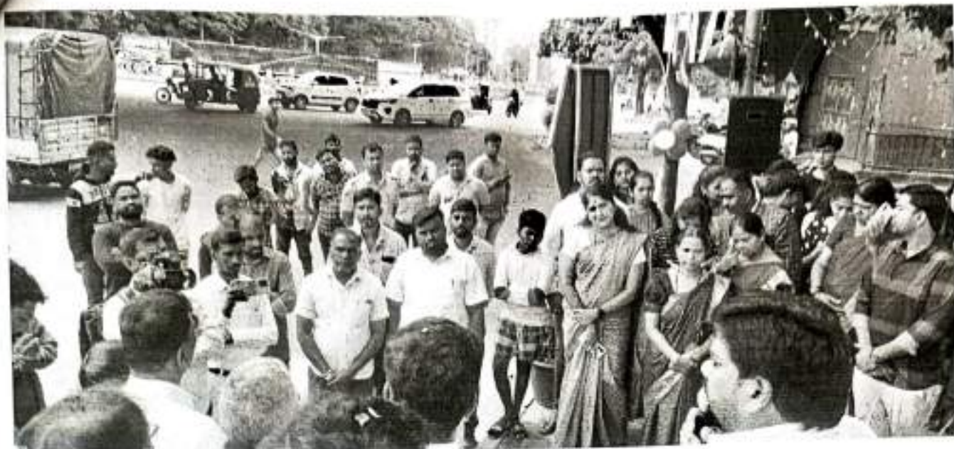
Staff at participated in Celebration