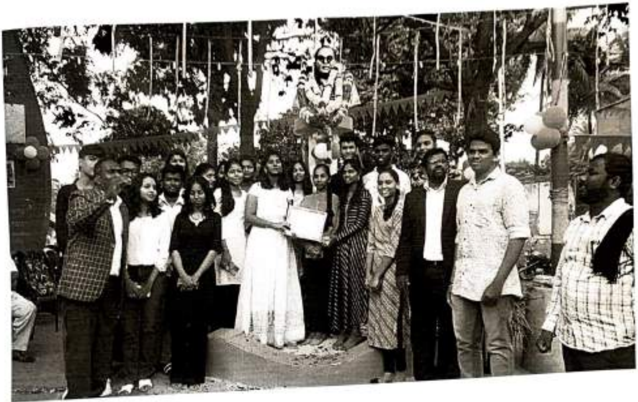
Ambedkar Study Center students with Samvidhan memento at Bangalore University