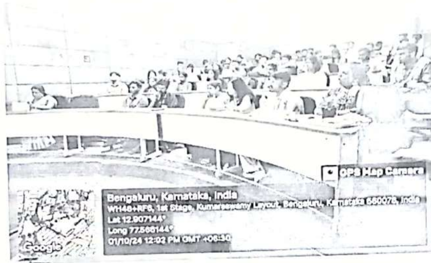
Students listening to the guest speaker