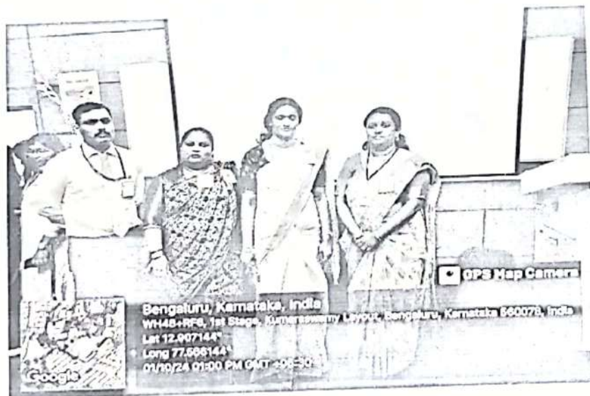
Faculty Co-ordinators with guest