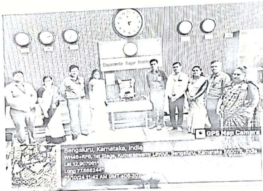
Faculty coordinators of Gandhi Study Cell along with HODs, IQAC Co-ordinator, and Principal