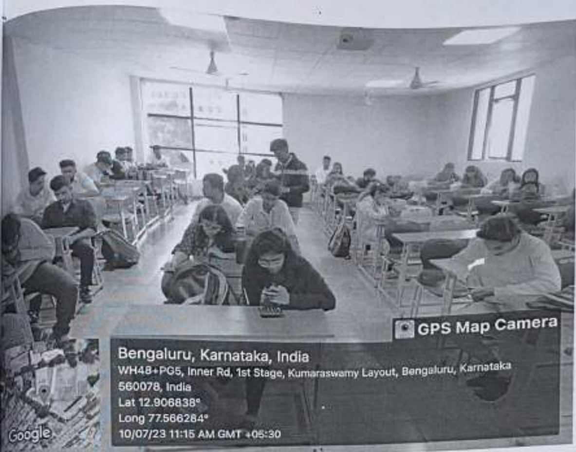
Image 1: All the students participating actively in the LOGO making event.