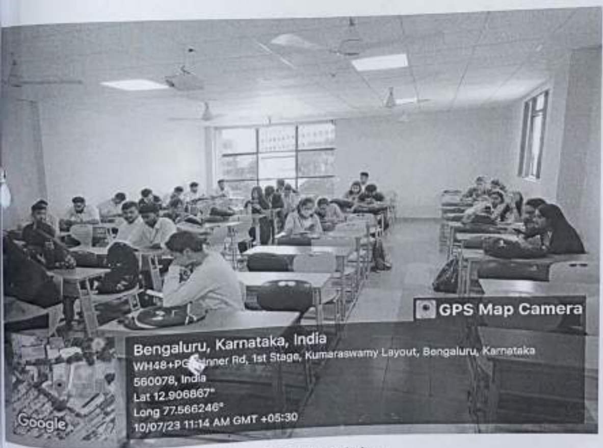
Image 2: Participants discussing in teams about creative LOGO designs.