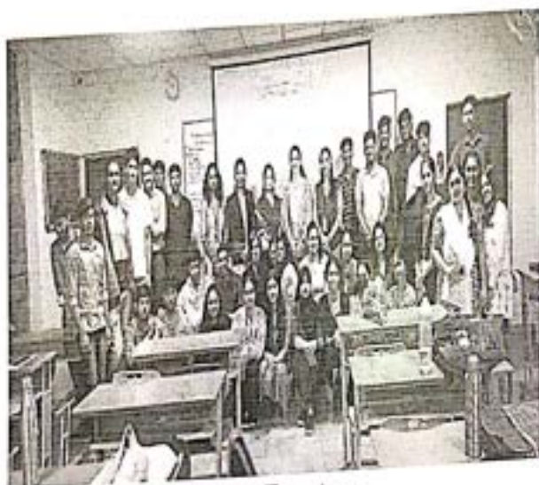
5. Participants of the Event