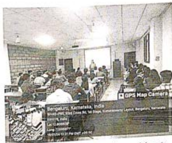
3. Resource Person Addressing the participants