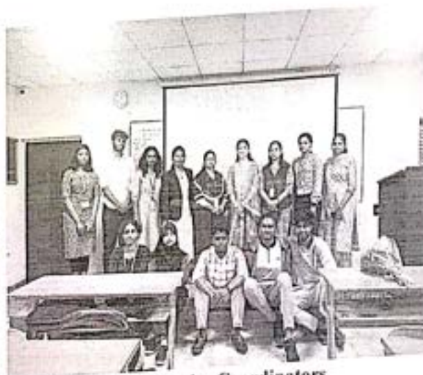
6. Students and Faculty Coordinators