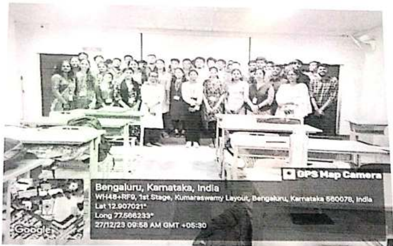
Group photo with participants