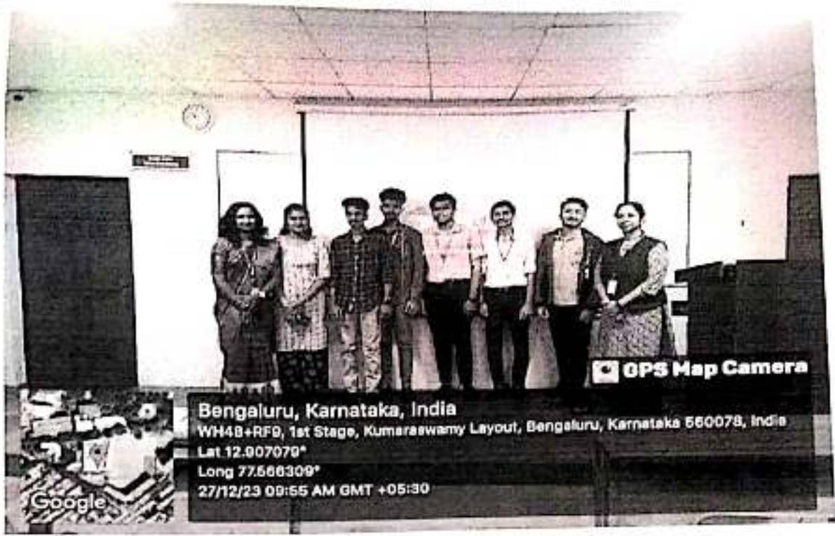
Prize winners for the Event-27.12.23