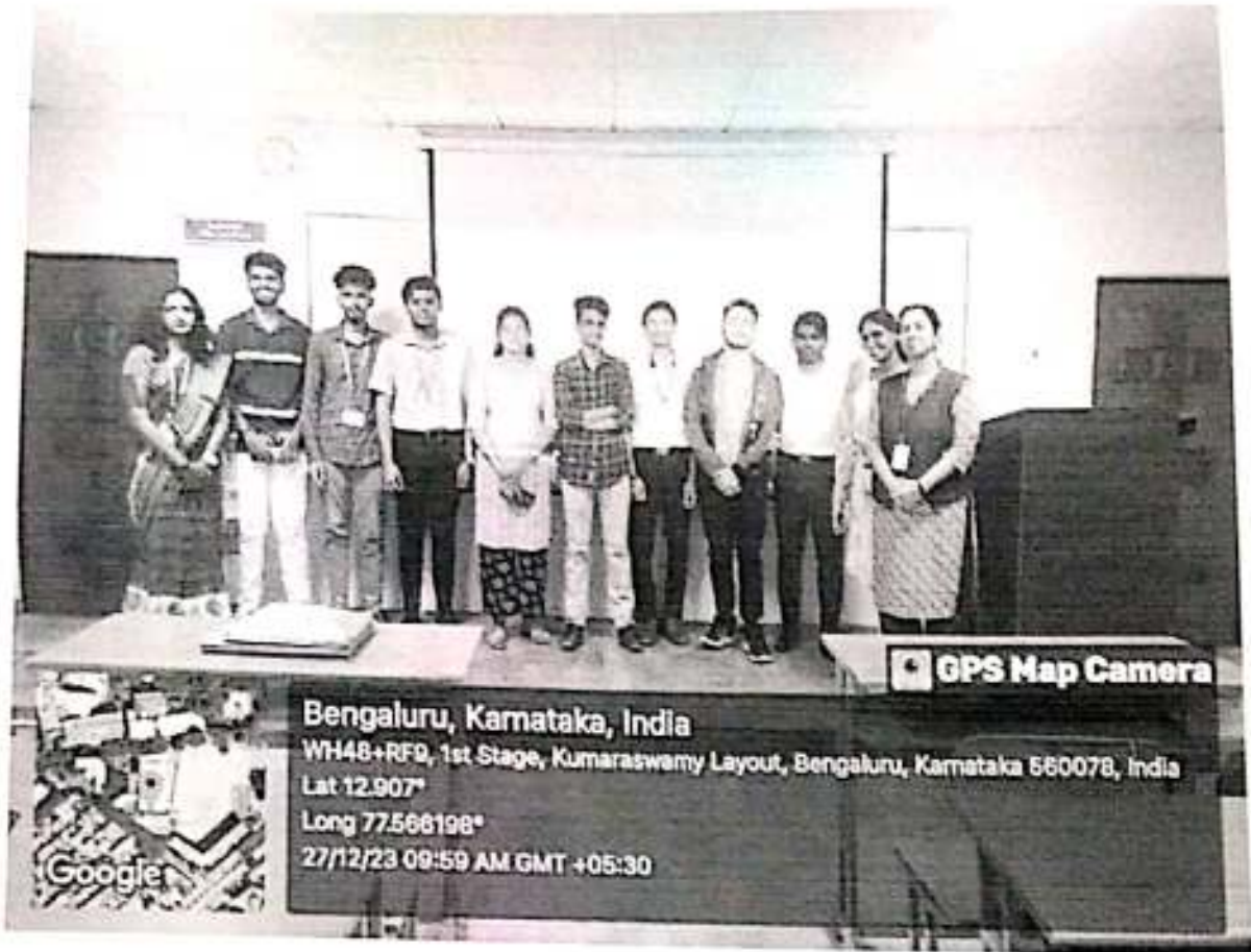
Prize winners with student coordinator & Faculty coordinator