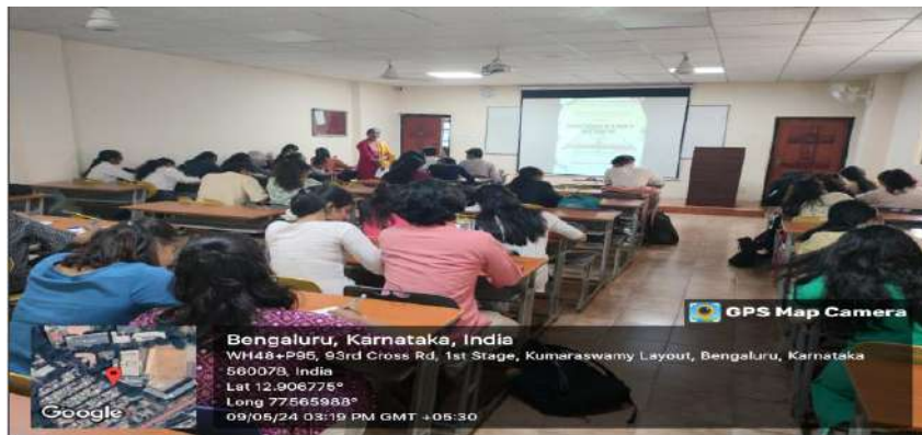
STUDENTS REVIEWING THE DOCUMENTARY ON "TEENS, SOCIAL MEDIA & TECHNOLOGY".