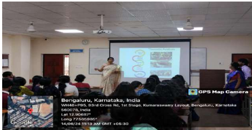
Students are interacting in the Guest Lecture.