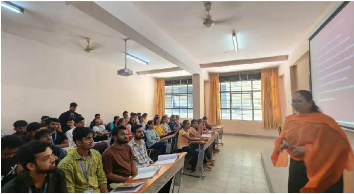
3. Interaction with students