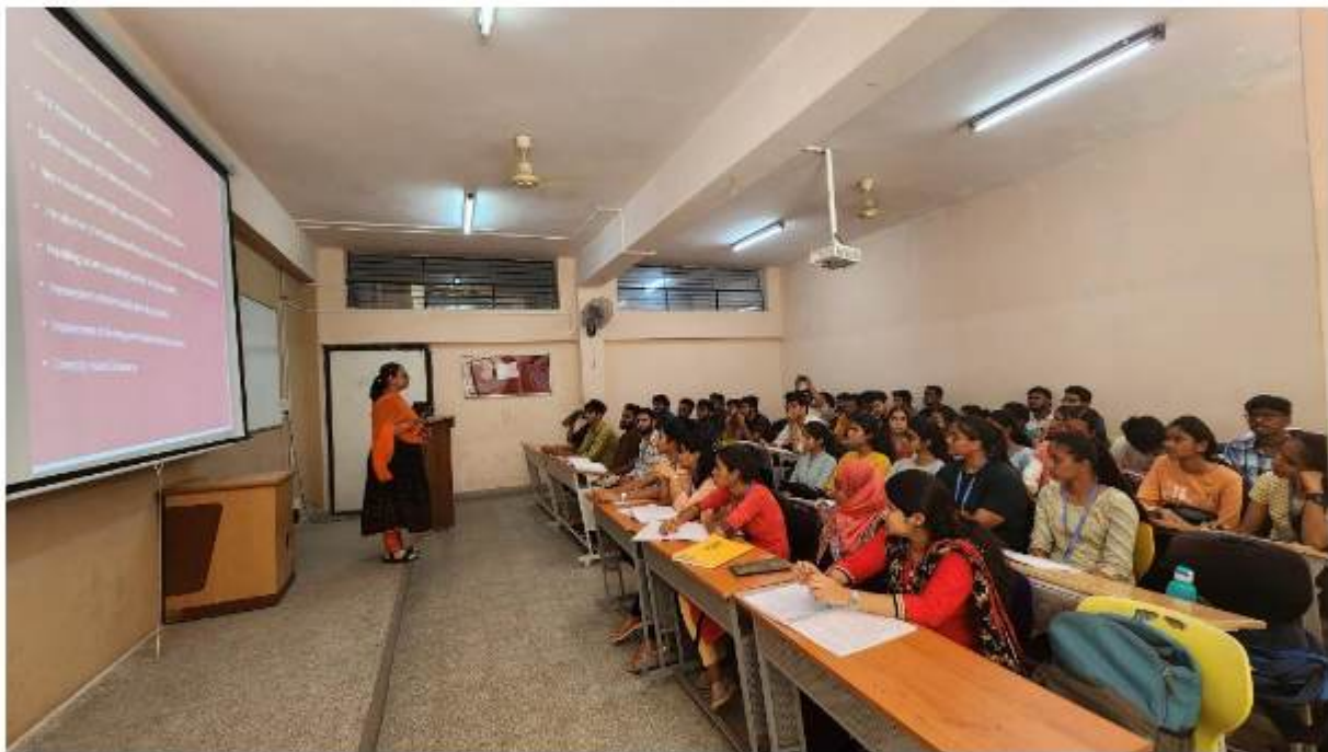
4. Students Participants