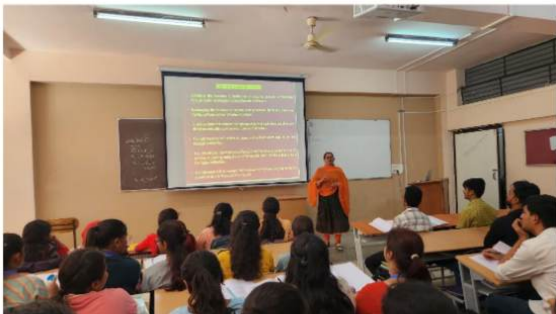
2. Objective of the cell