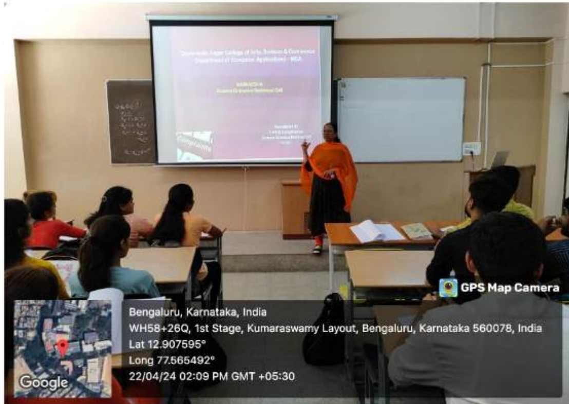
1. Speaker explaining vision and mission of the cell