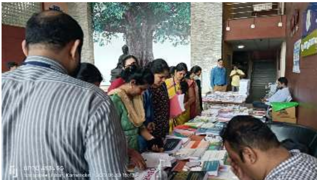
Staff members participated in the book exhibition