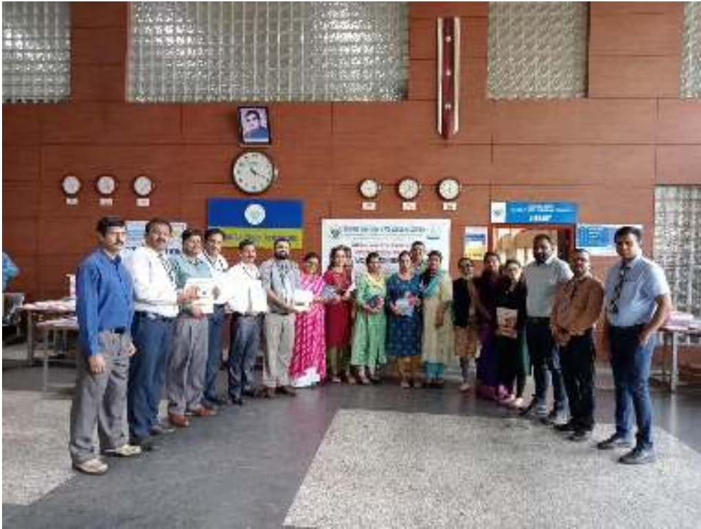
Faculty group Photo during the Books Exhibition