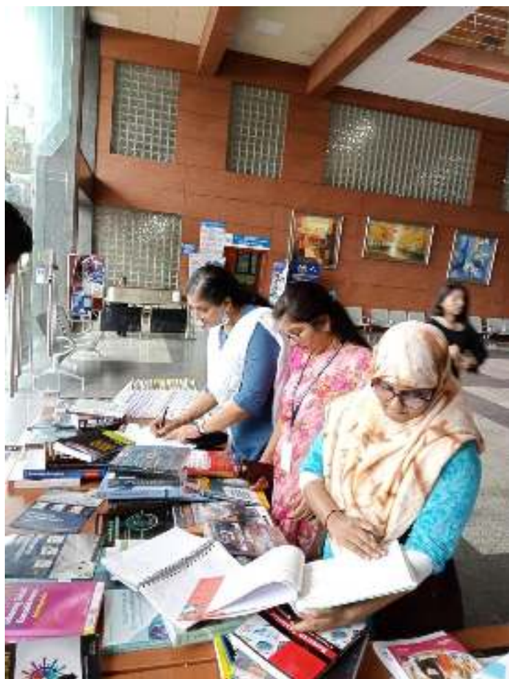
Faculty participated in the book exhibition