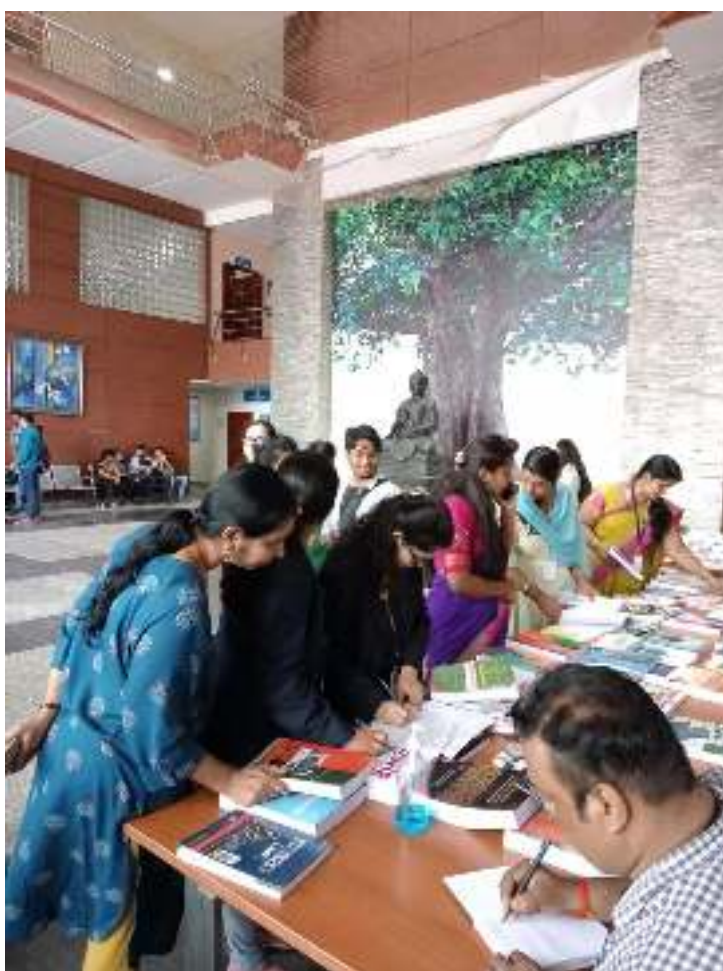
Faculty participated in the book exhibition