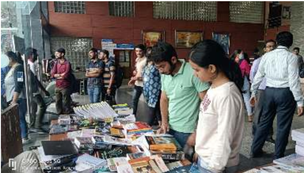
Students participated during the book exhibition