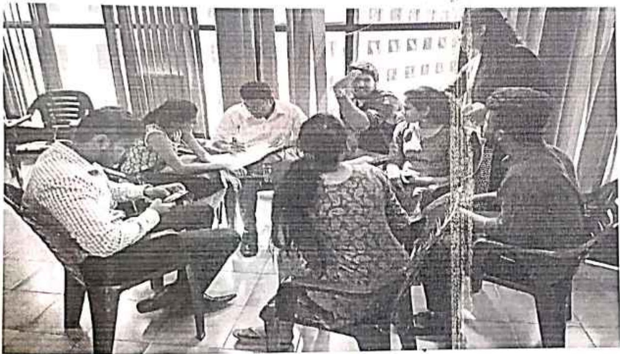
Students working in teams