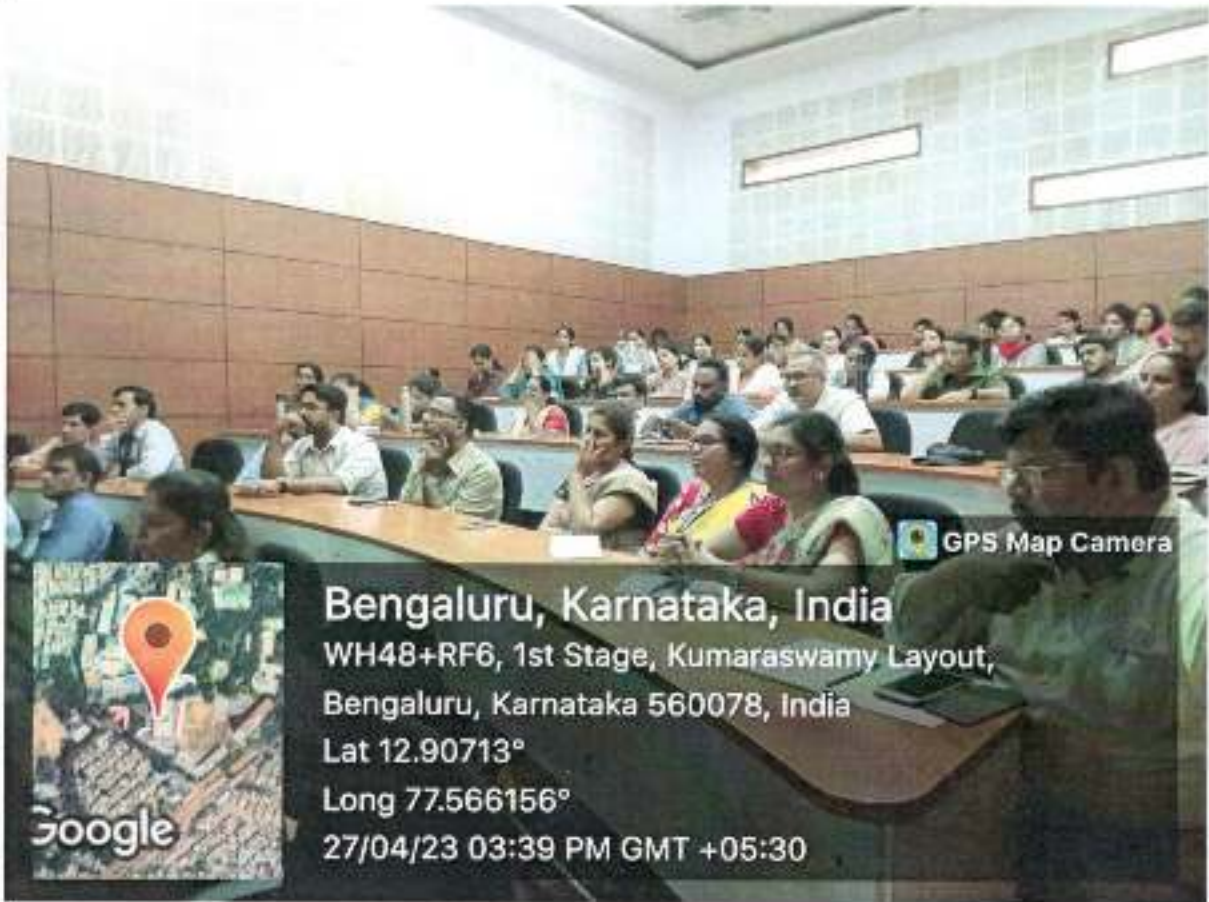
Faculty members participated during training session .