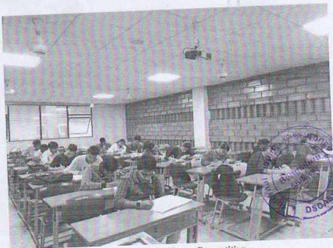
Students Attending Essay Competition