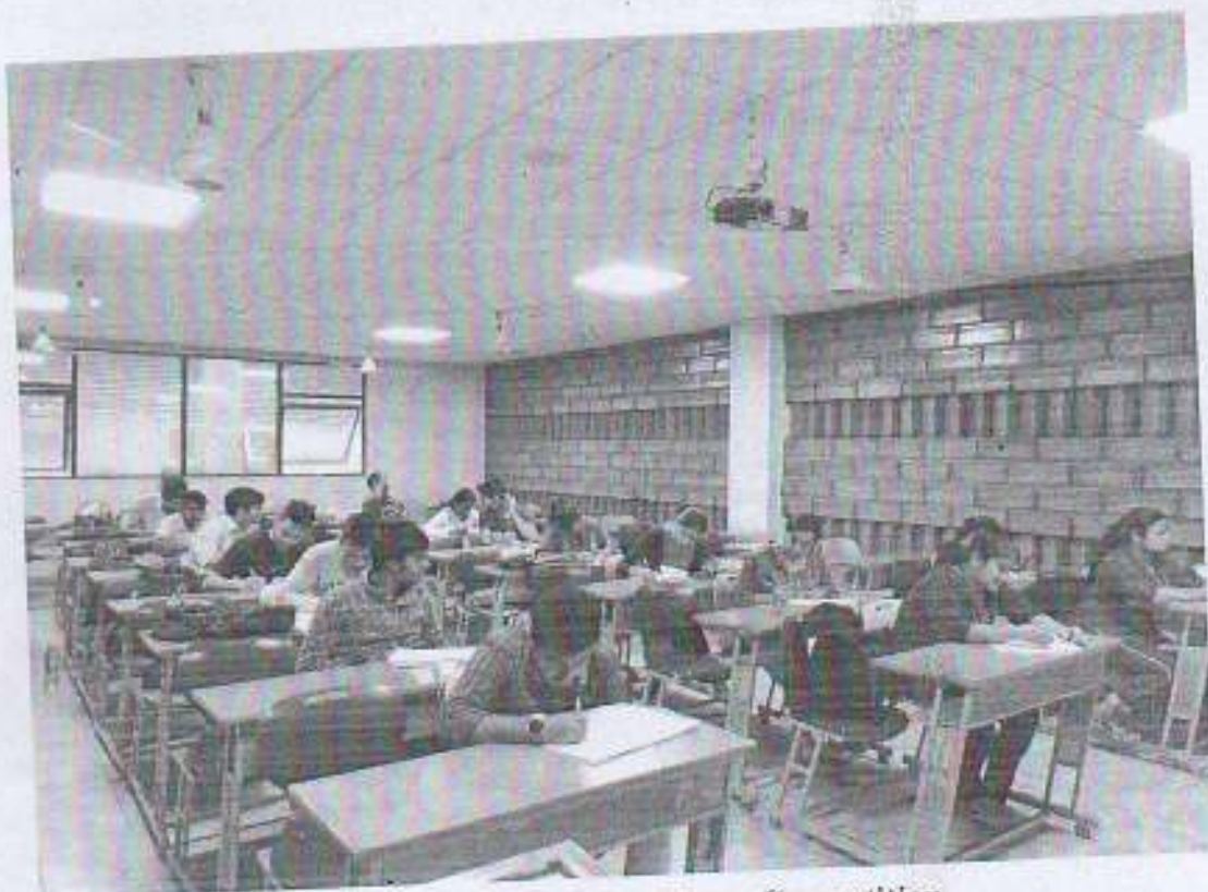
Students Attending Essay Competition