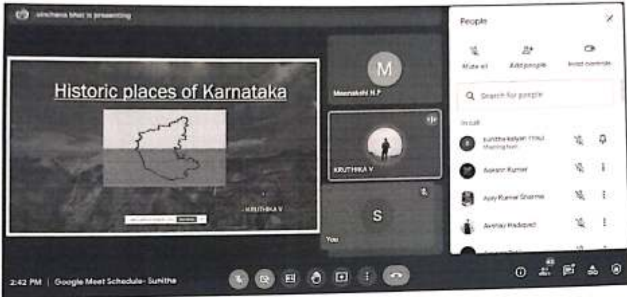
1. Historic places of Karnataka