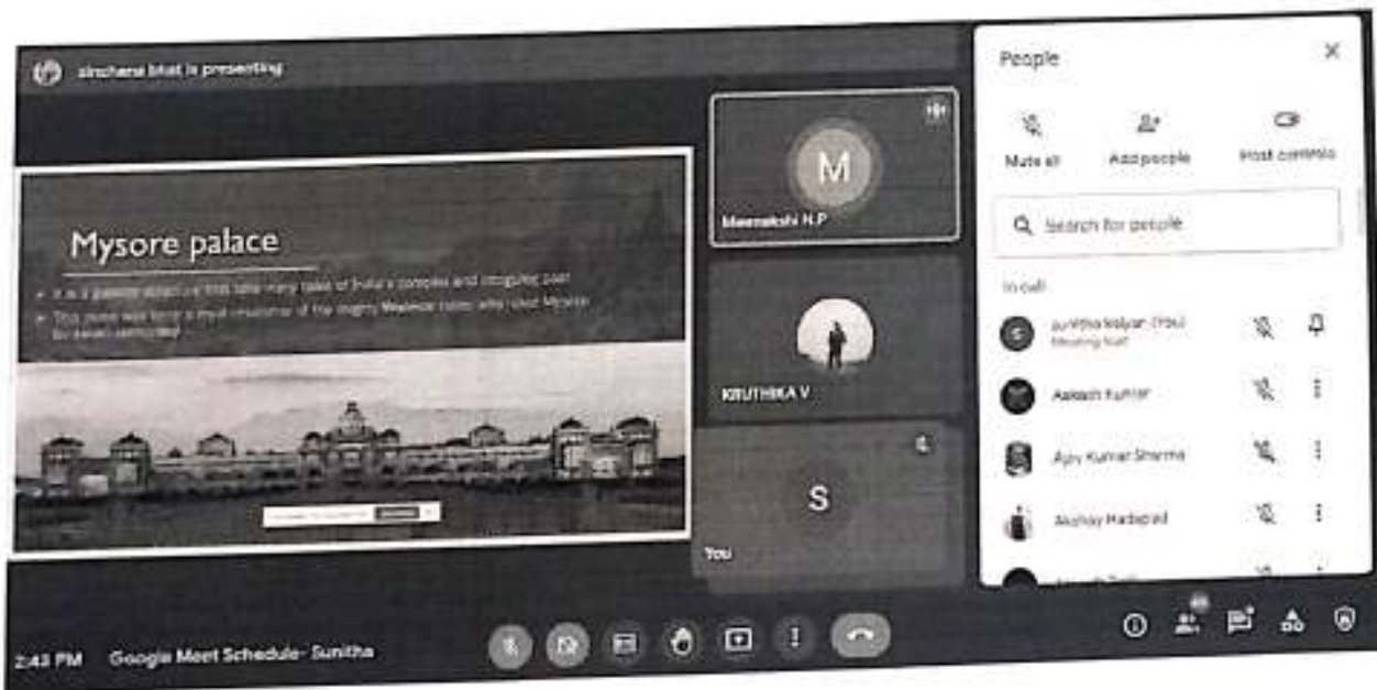
2. Mysore Palace