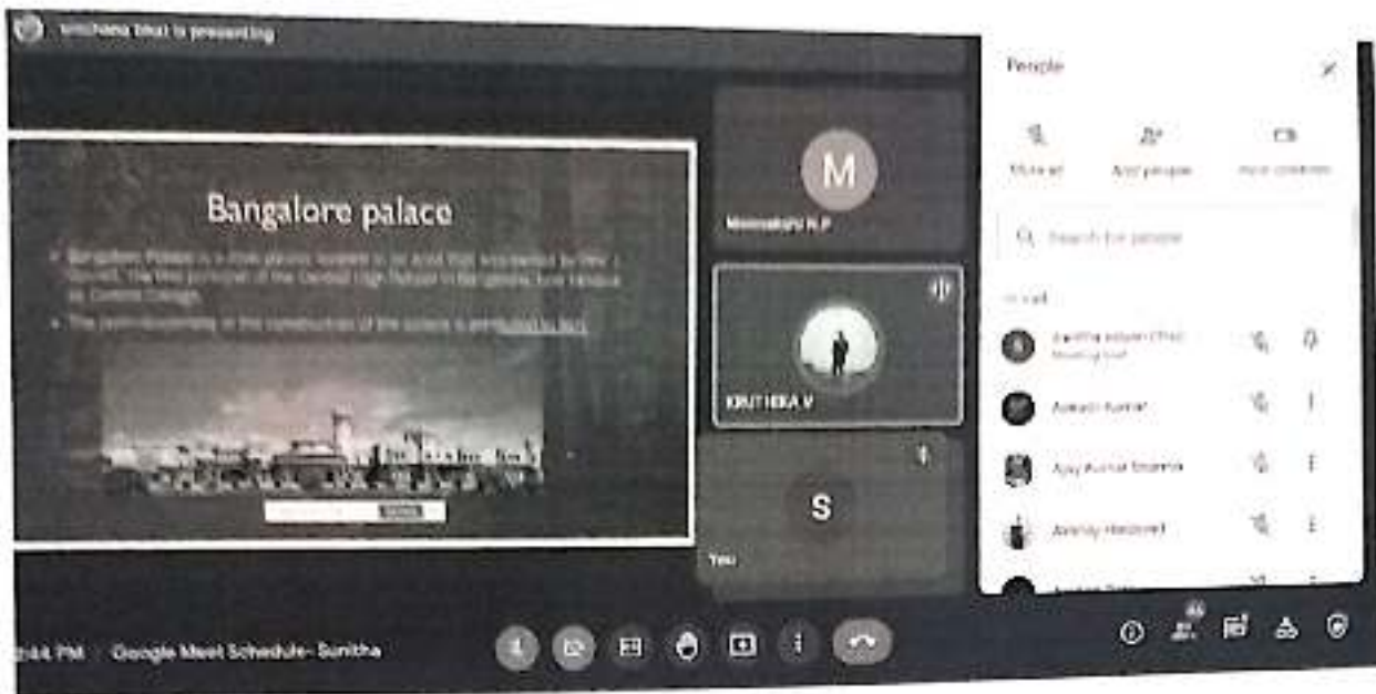
3. Bangalore Palace