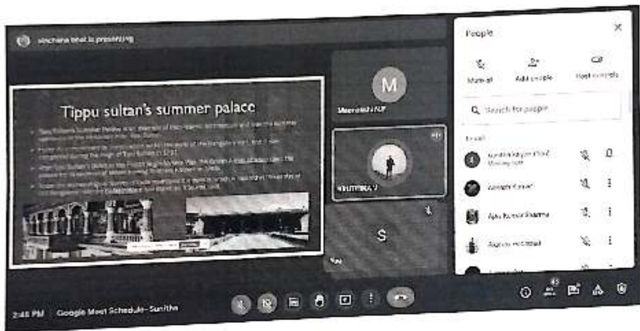
4. Tippu Sultan's Summer palace