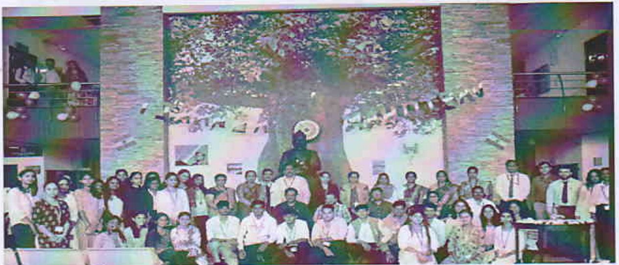
Language faculty, HODs, and students took part with great enthusiasm.