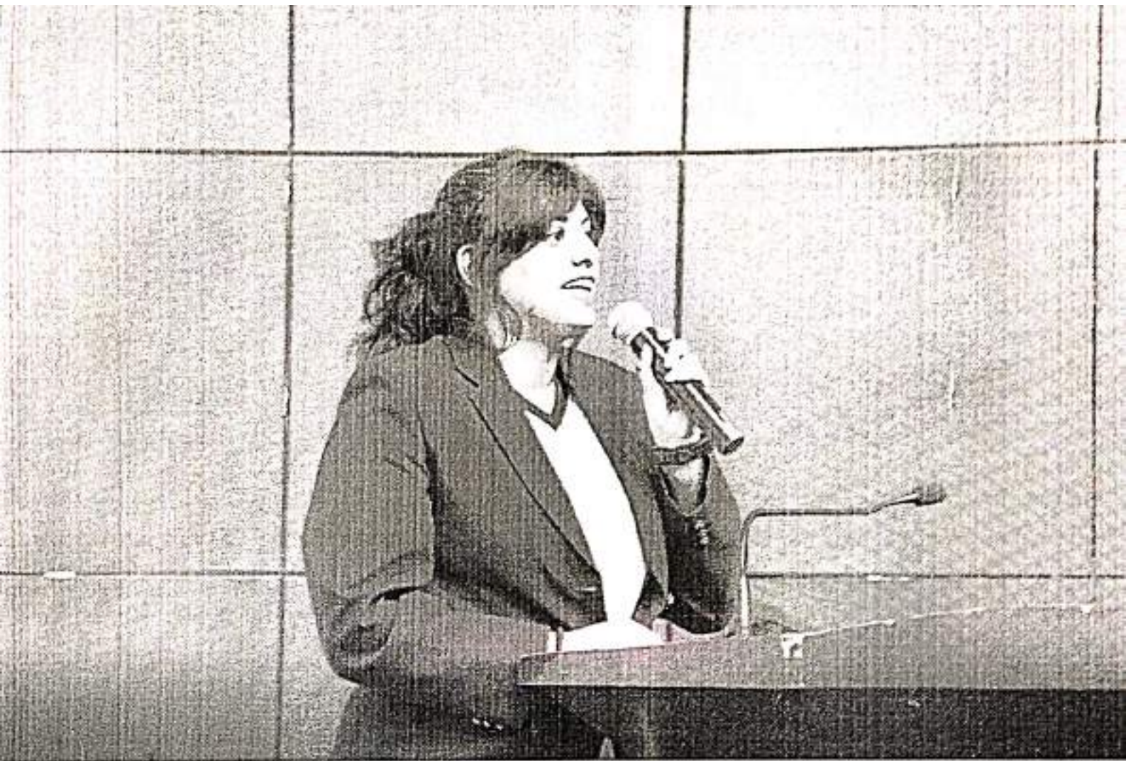
Chief Guest addressing the audience