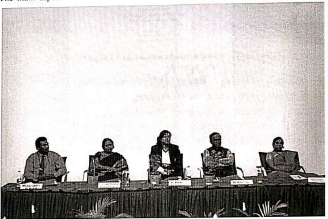
Dignitaries seated on the Dias along with the Chief Guest & Guest of Honor