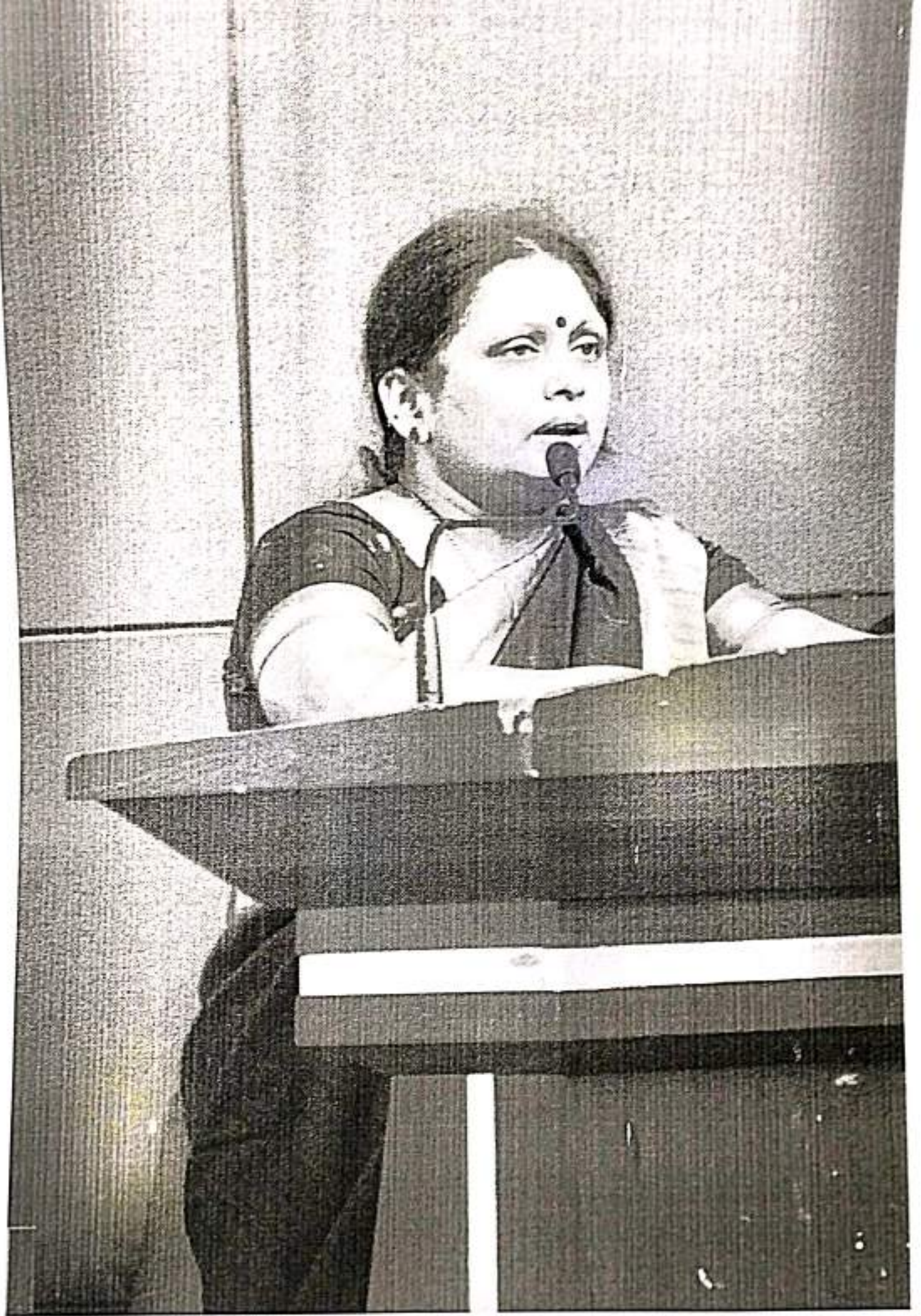
Guest of Honour addressing the audience