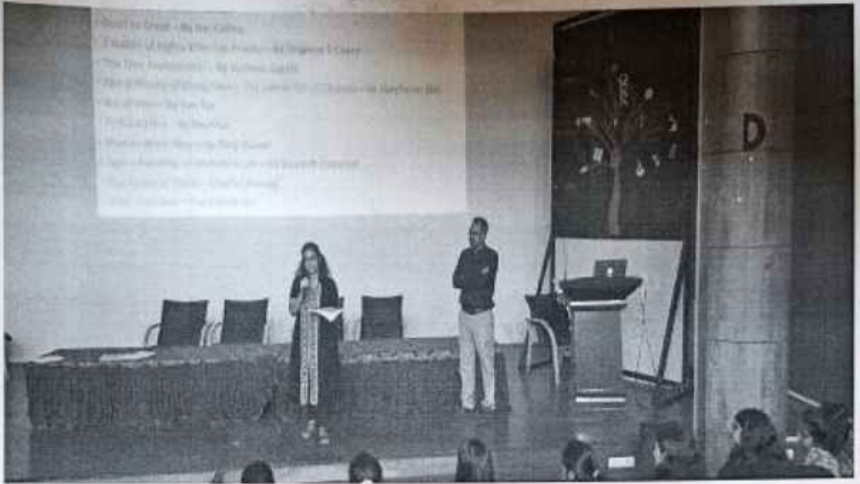
A student sharing her thoughts about reading books and its importance in Research and IPR- Copy right