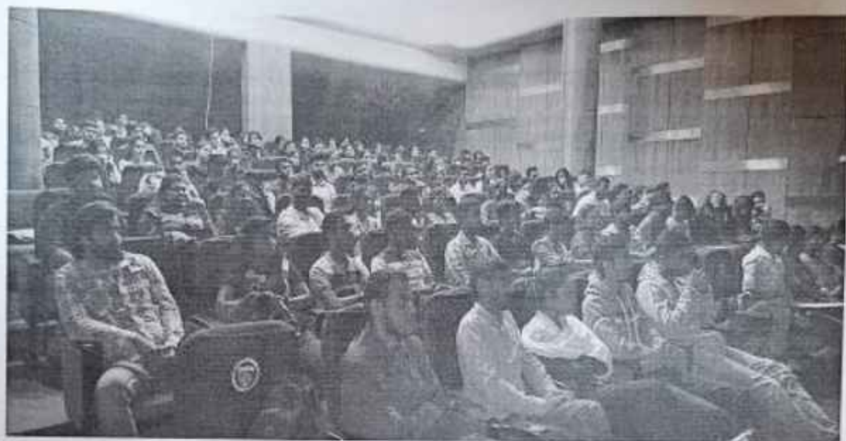
Students watching a Video clip on Intellectual Property Rights- Copyrights