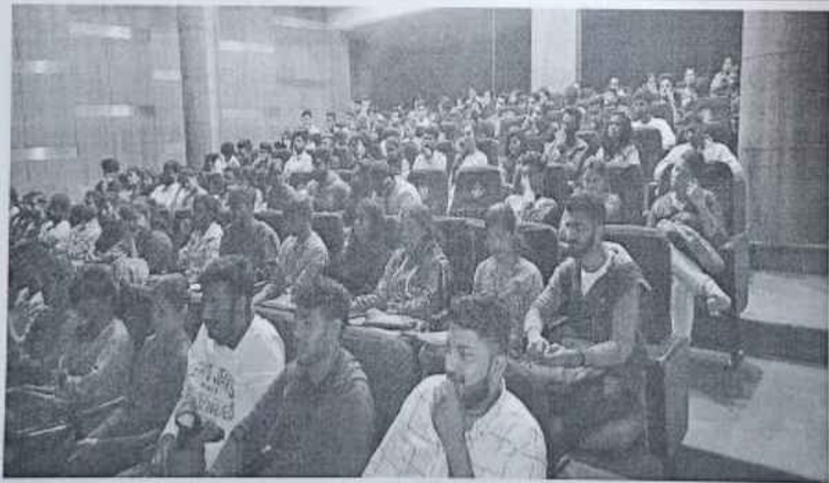
Students involvement in Intellectual Property Rights- Copyrights session