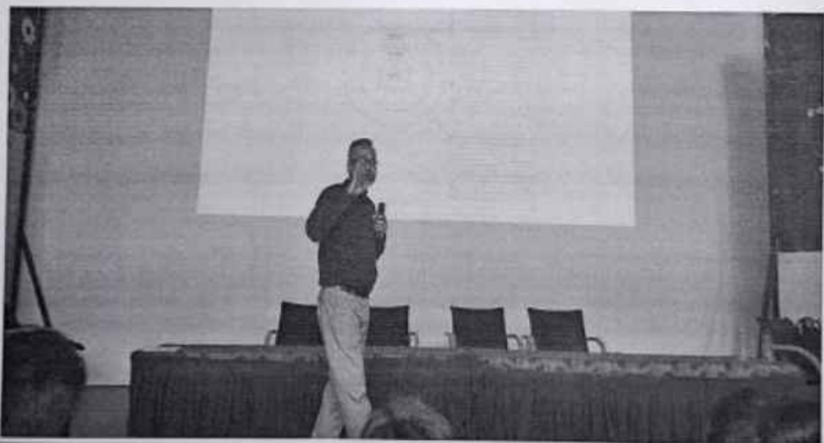
Facilitator explaining Research and IPR