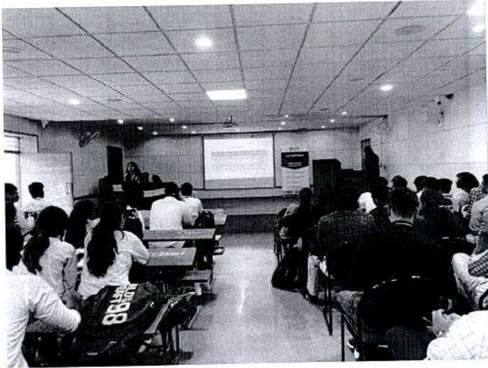
Pic3 focus areas for the students