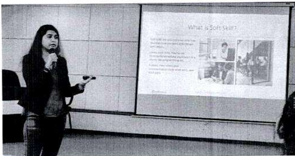
Pic 2 What is soft skill?