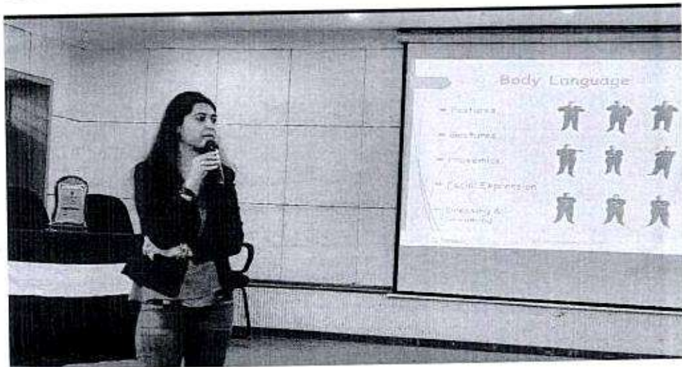
Pic 4 Body Language and how to have good body language