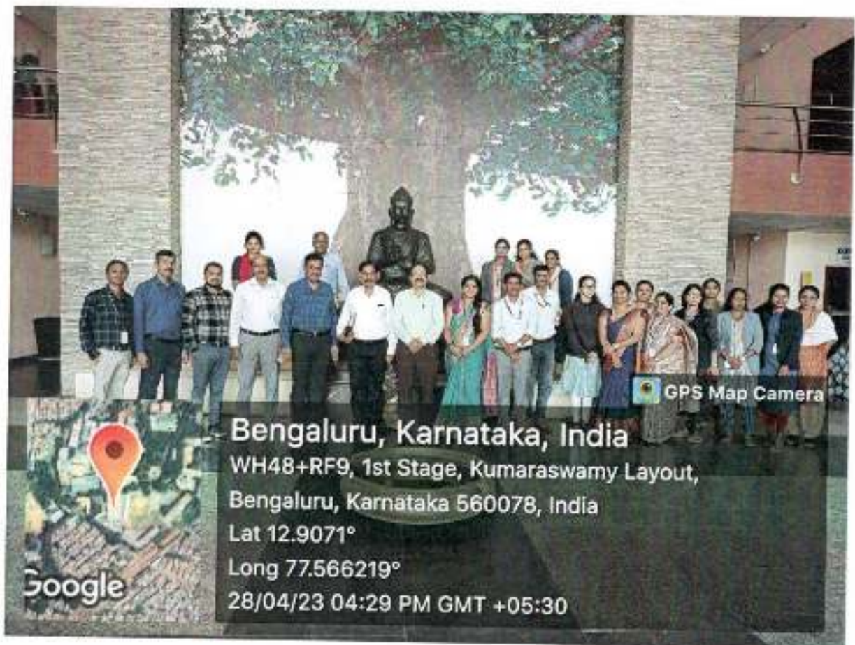
Training programme group photo with library staff members, Resource person, Principal and IQAC Co coordinator.