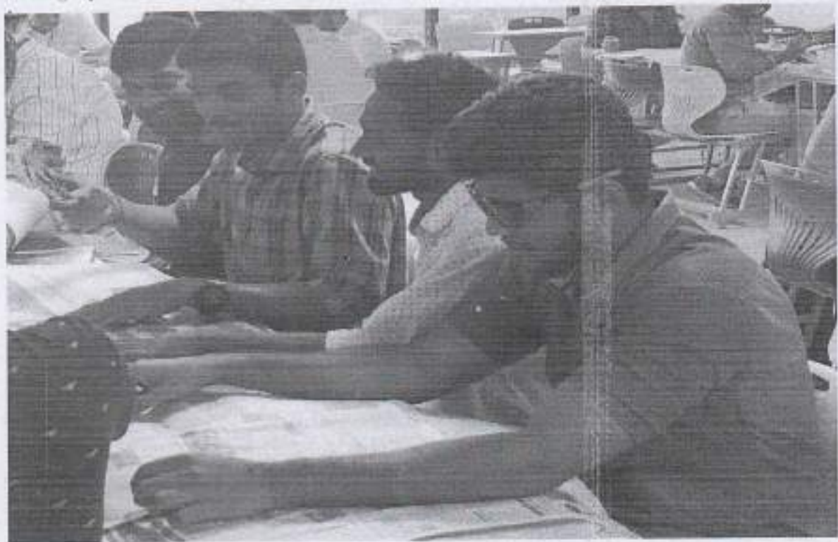
Students reading newspaper as an activity during the workshop