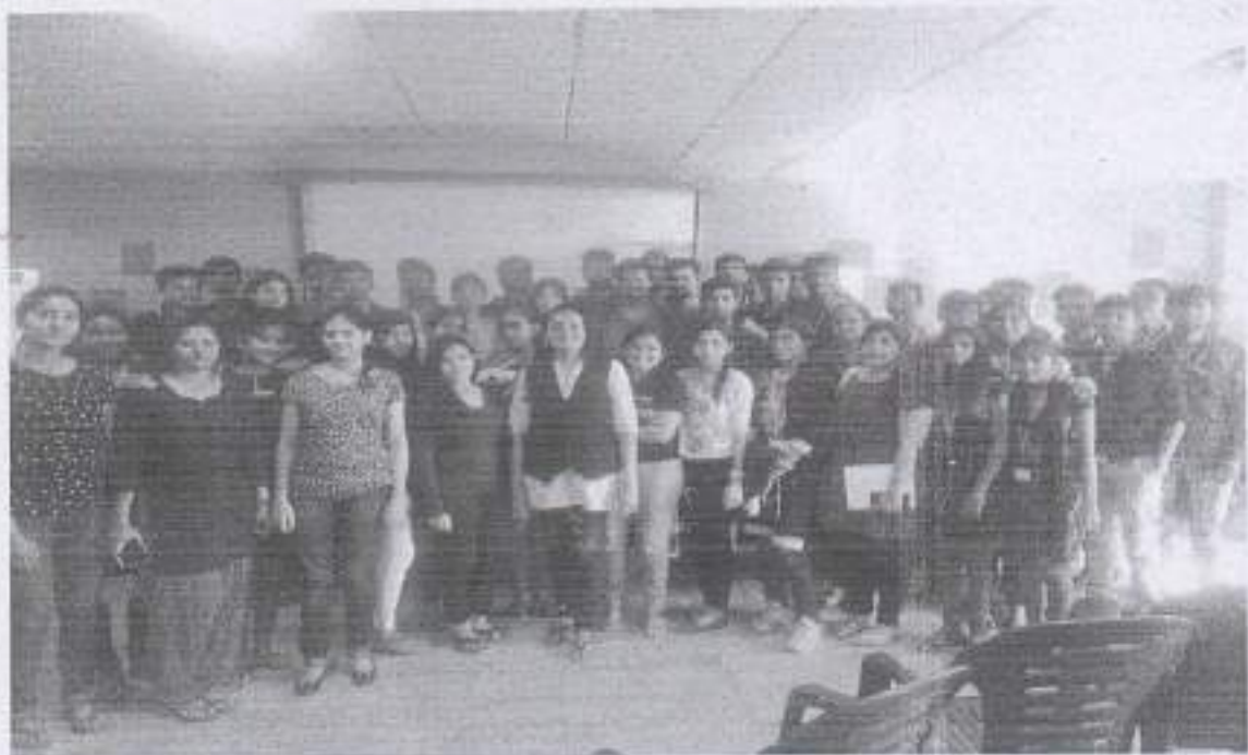
Students at the end of the pre-placement training program