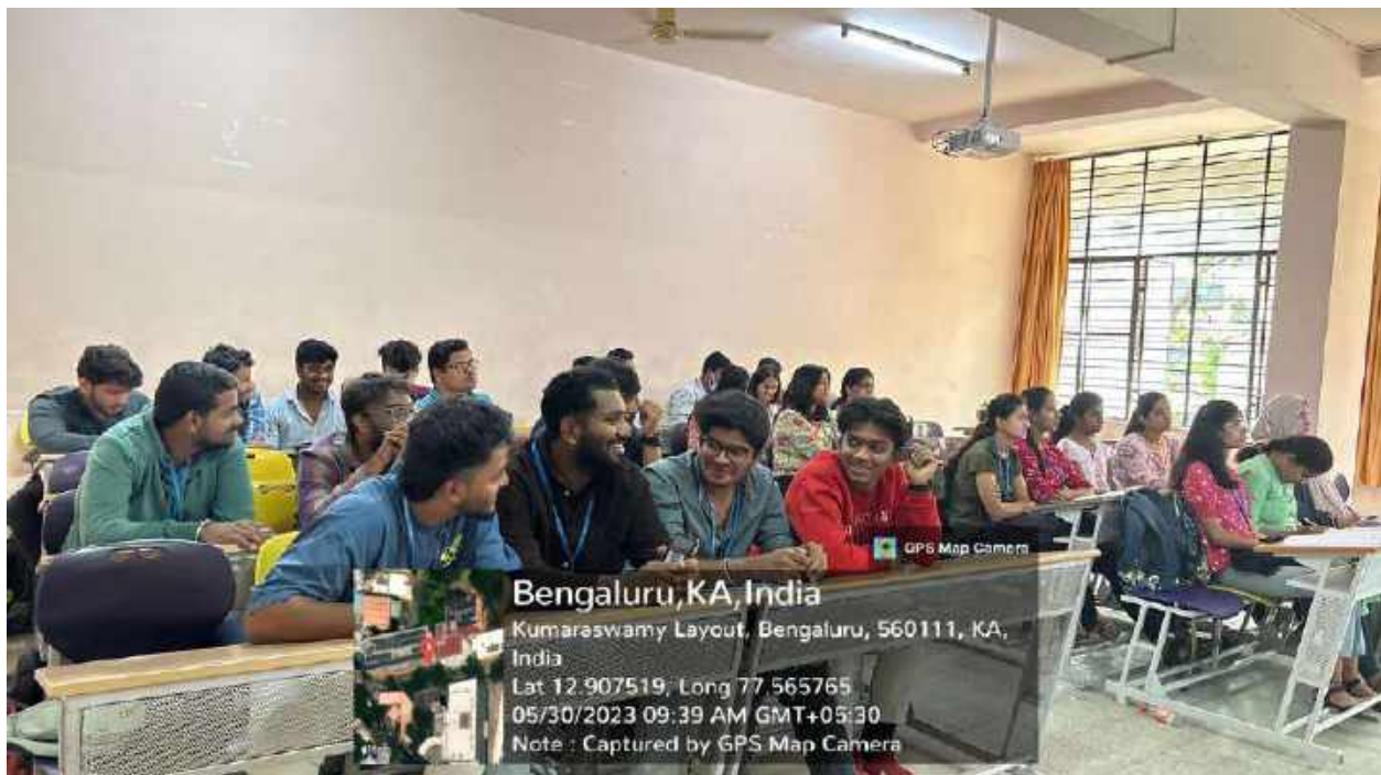
Photo4: Students participated in the presentation