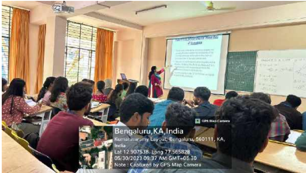
Photo3: Post metric scholarship for Minorities