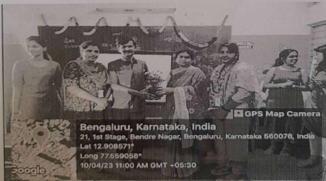
2. Hounarung School Principal