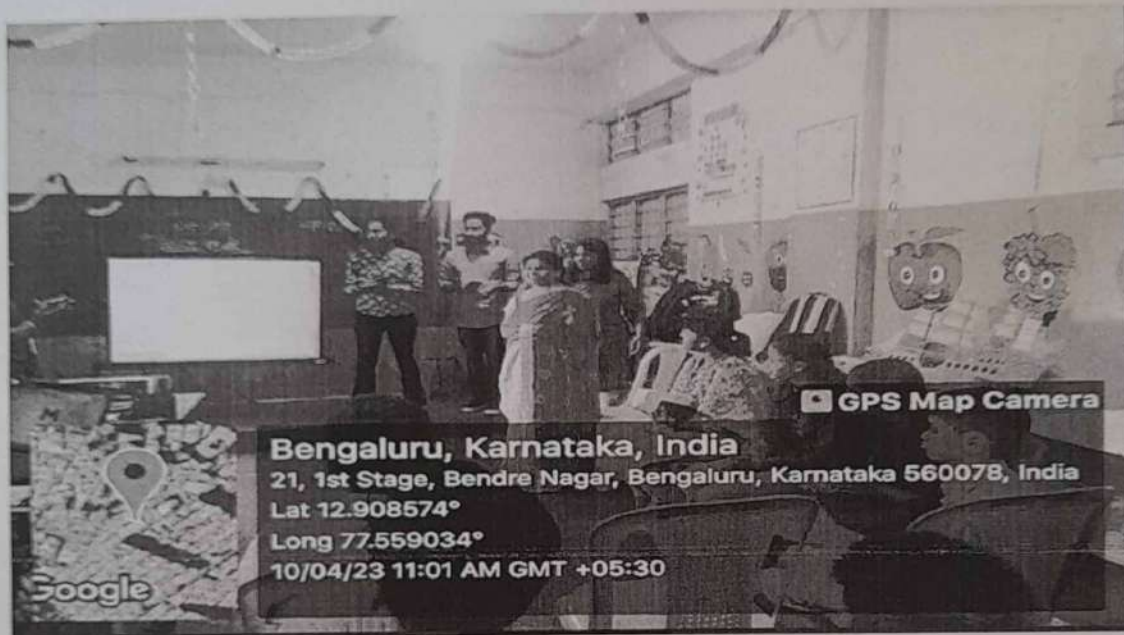
1 well come Speech by MCA Students