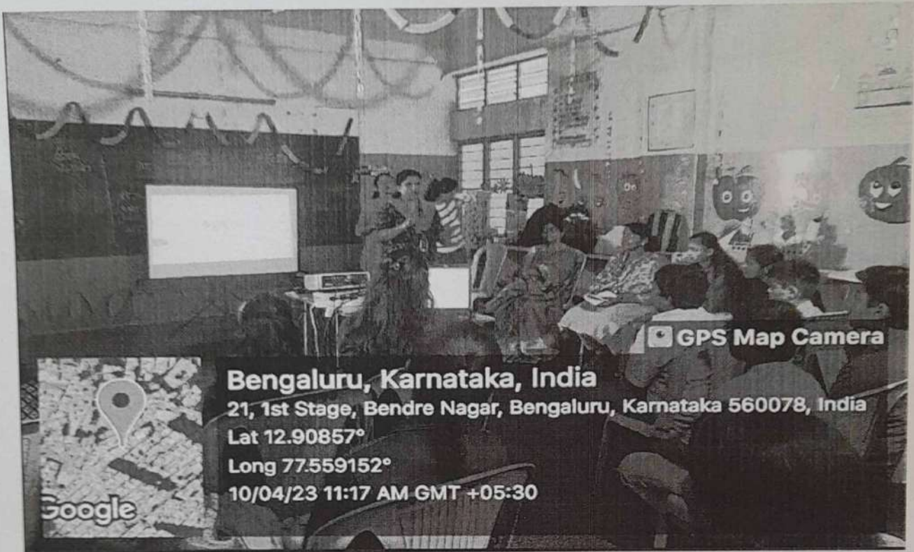
3. Introduction about the programme.