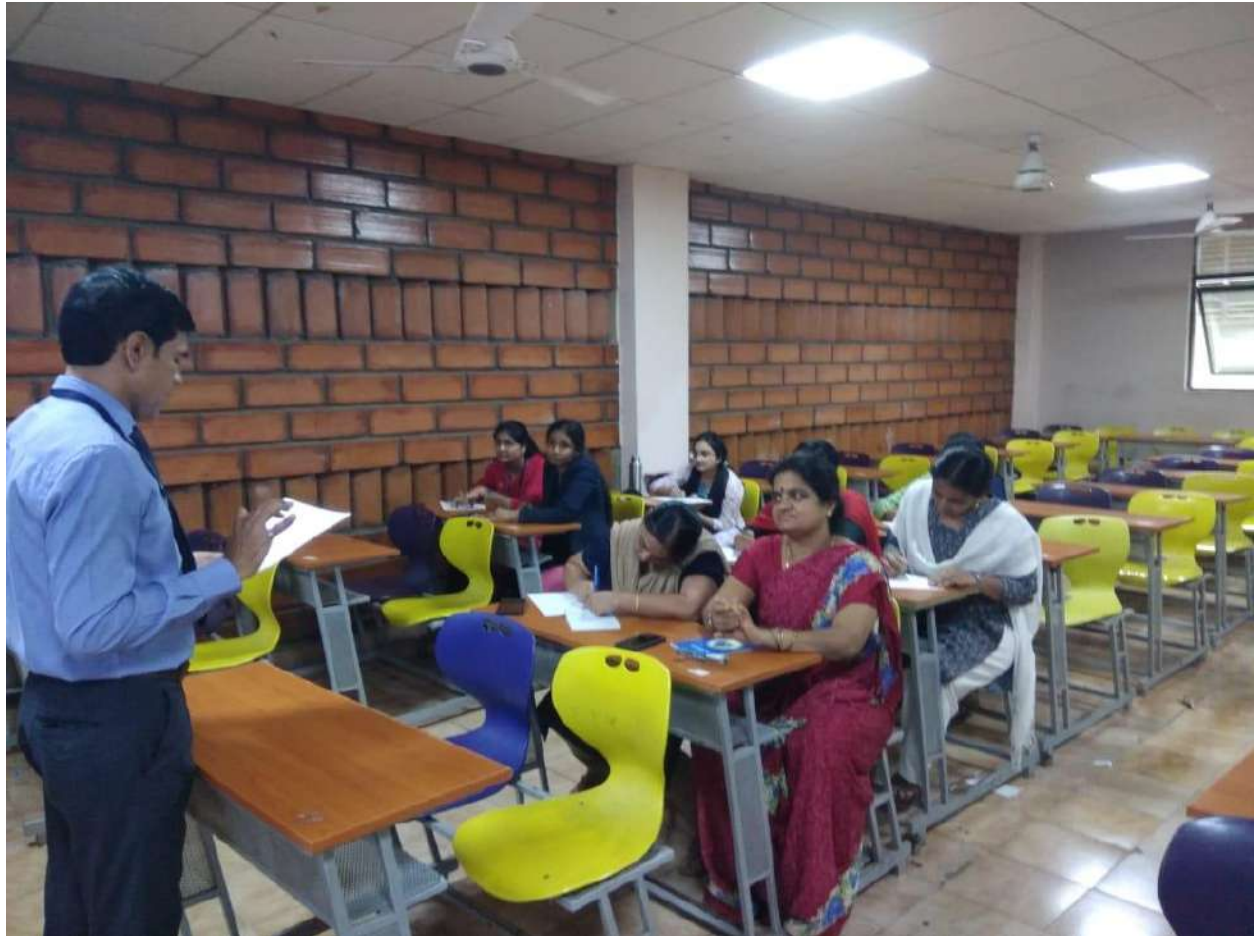
Participants attending the Session