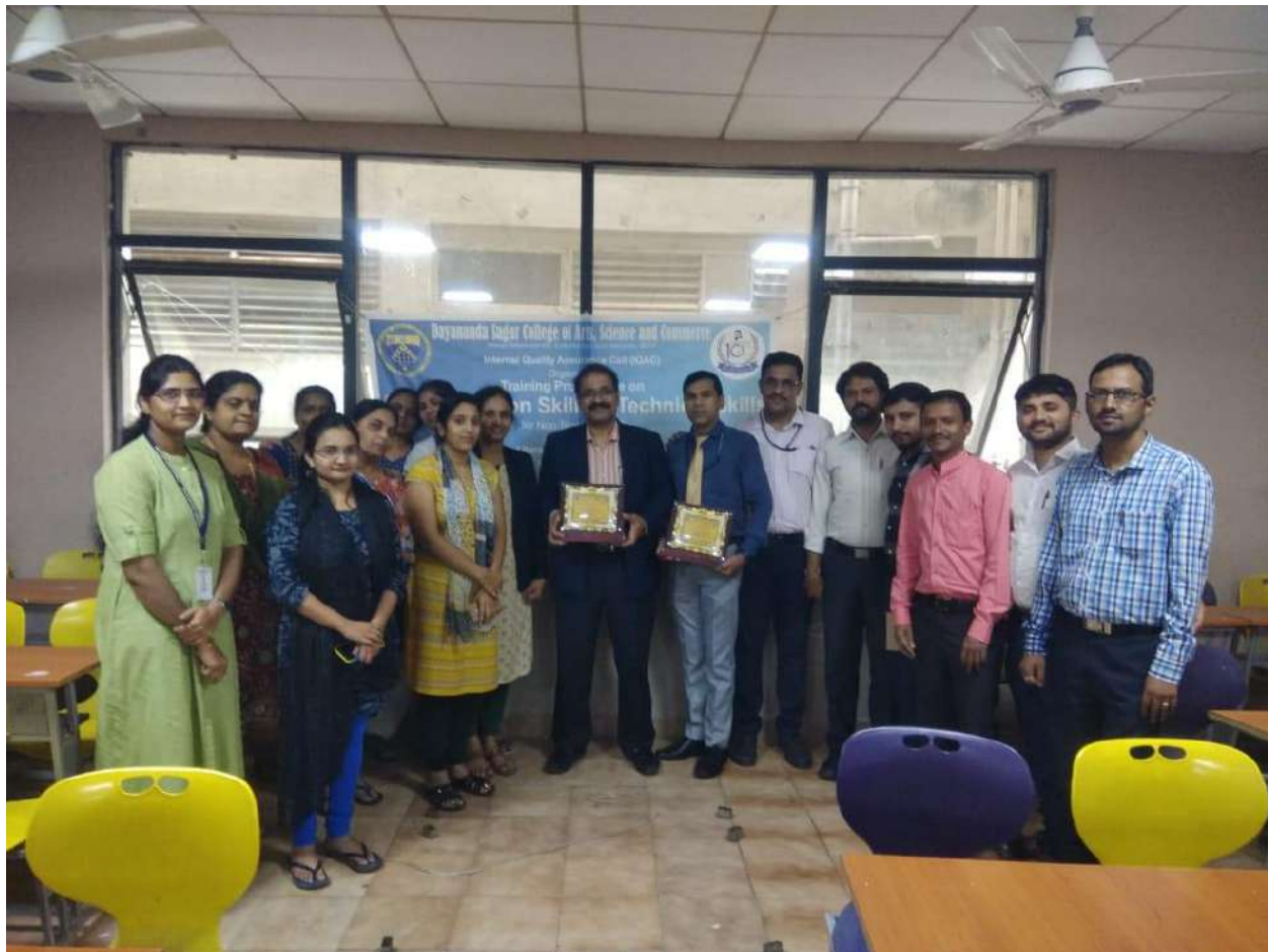
Felicitation to the Speakers

Venue: Classroom #212, 2 nd Floor, Building #13