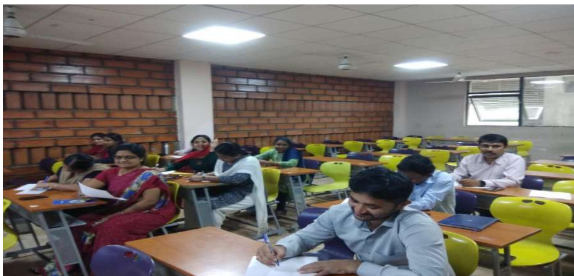
Participants taking part in activity