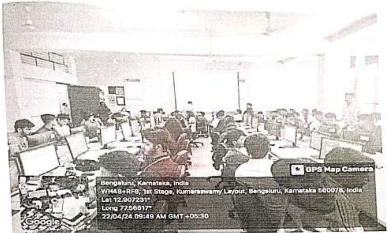
Photo 2: The students of II SEM BBA actively involved in the Bizslab Orientation session on 22 nd April 2024.