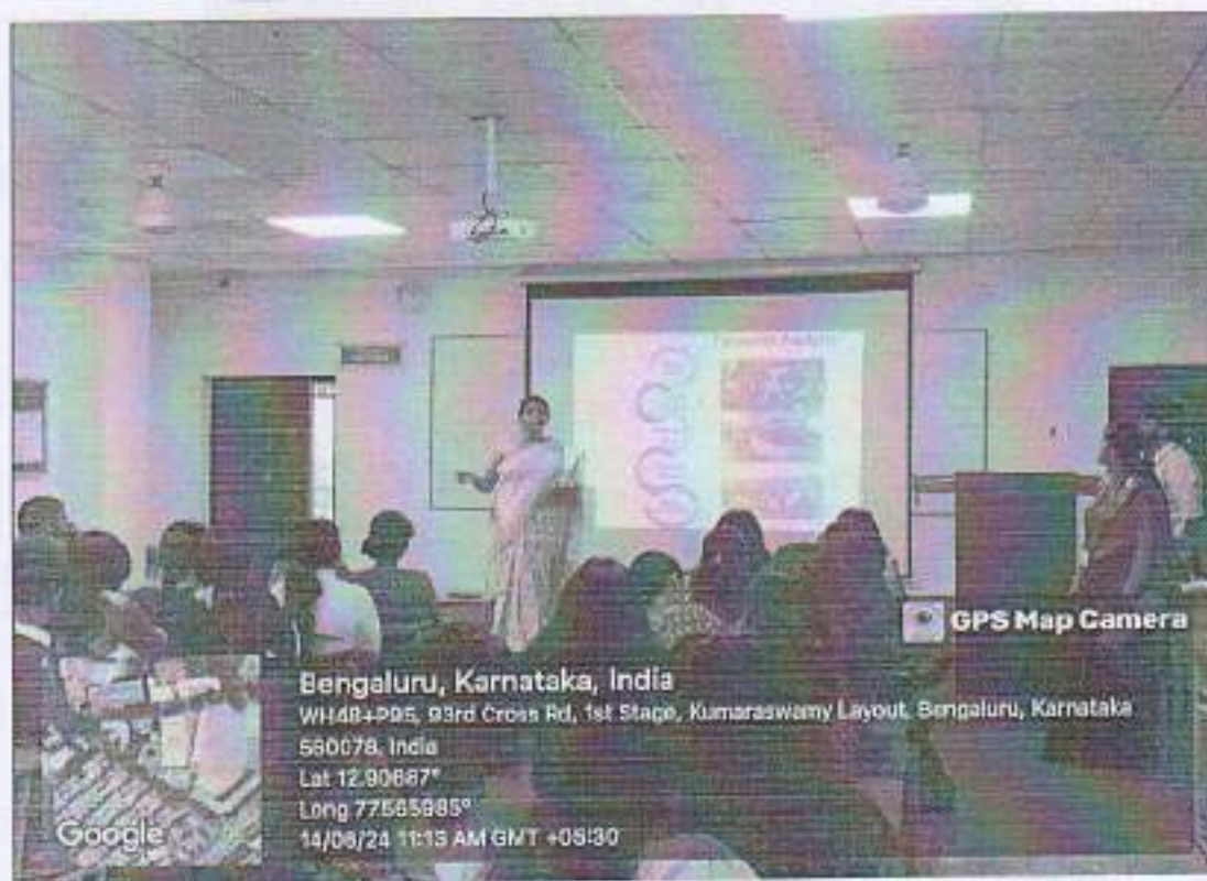
Students are interacting in the Guest Lecture.