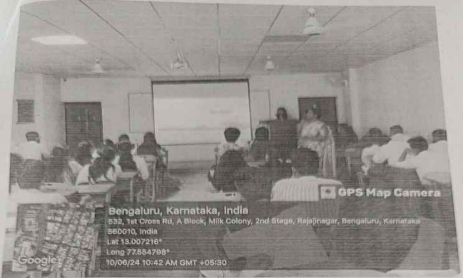
Image 3: Guest speaker giving live examples about the topic and interacting with the participants.