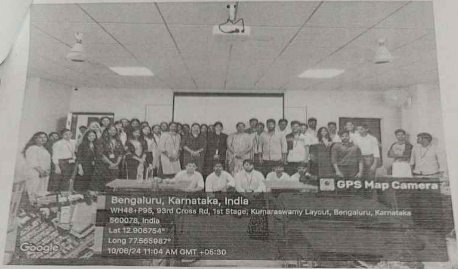
Image 5: All the participants, event co-ordinators with the guest speaker.