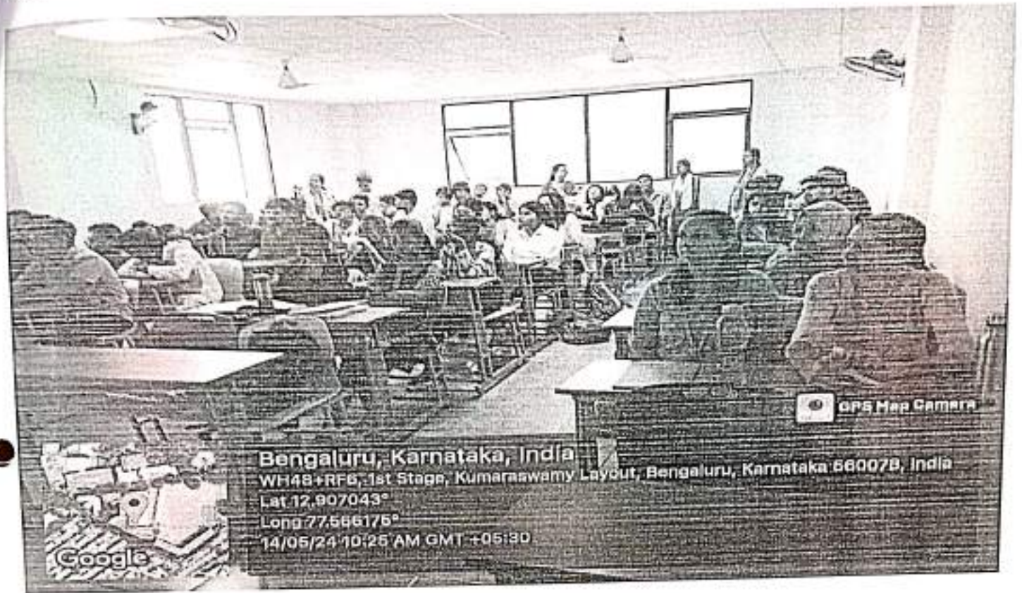
Photo:1 Students participating with enthusiasm