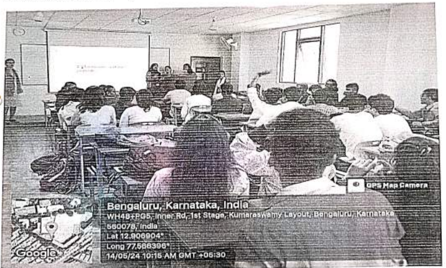
Photo:2 Students were asked with finance related questions