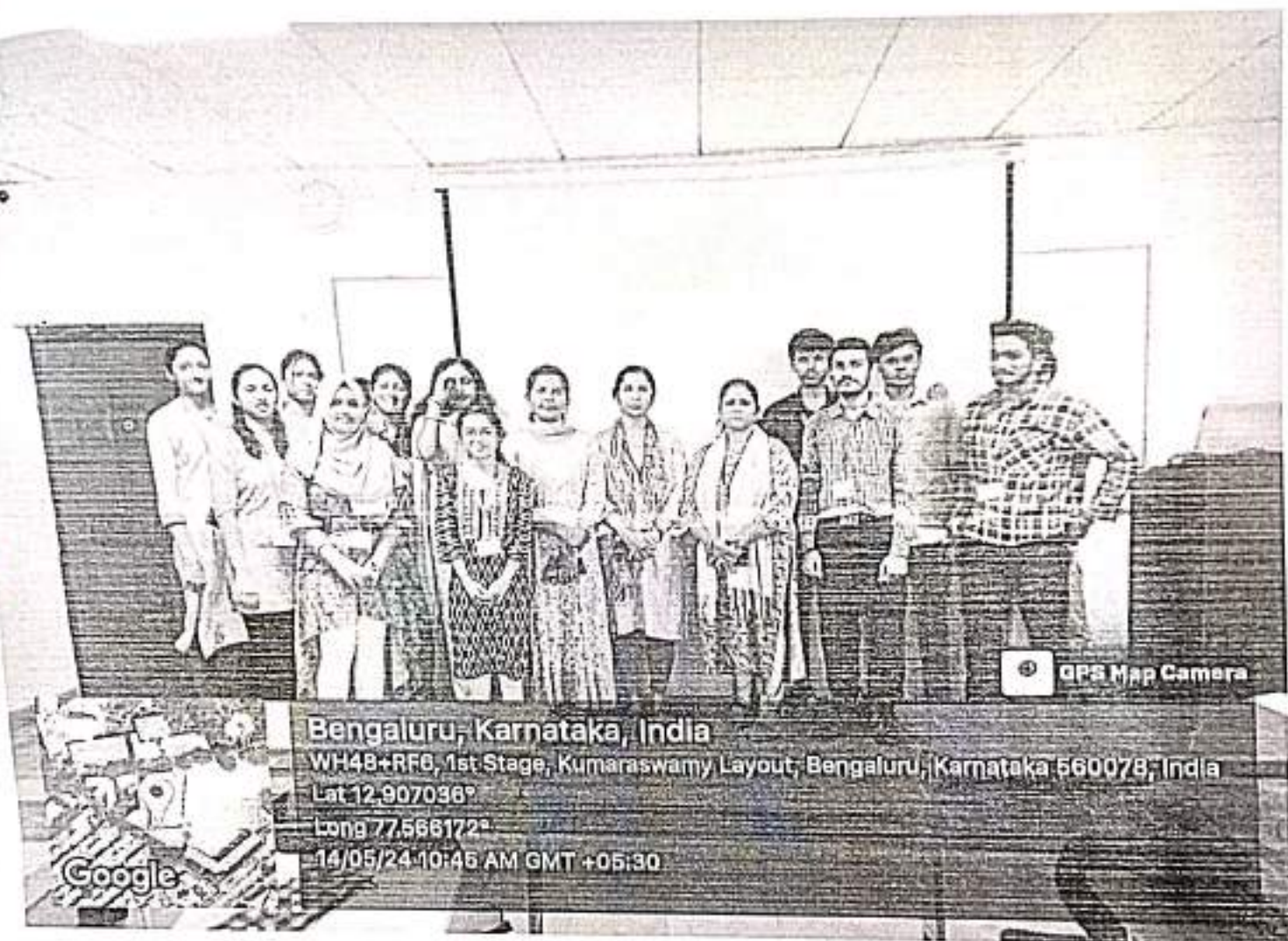
Photo:5 Faculty observers with participants